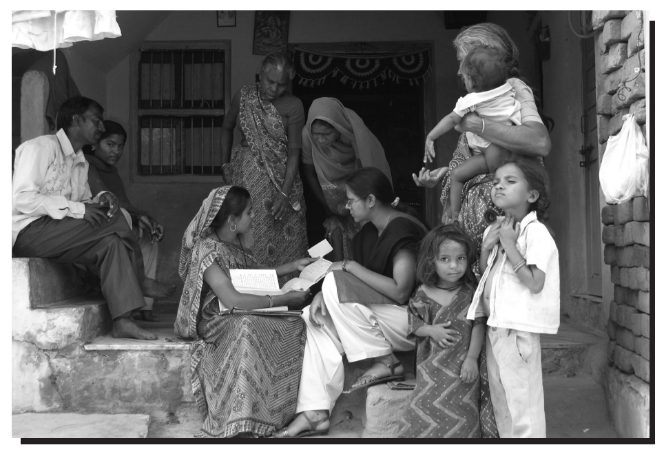
Consultation with a family of informal workers in India.

Much like formal counterparts, informal workers and enterprises are experiencing decreasing demand for goods and services, rising cost of inputs, and increasing pricing volatility for goods sold. In contrast to formal workers, informal workers are experiencing increasing competition and swelling ranks of their trades. Contrary to conventional wisdom, expanding employment in the informal economy does not mean informal workers are thriving during the recession. Unlike some of their formal counterparts, informal firms and informal wage workers have no 'cushion' to fall back on and have little option but to keep operating or working through these economically challenging times.