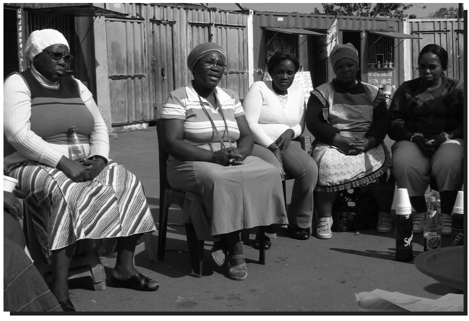
Street vendors voice their demands in Durban, South Africa.

Informal workers feel that there are a number of specific actions that governments can take to help alleviate their hardship during the crisis. Emergency measures such as soup kitchens or community kitchens will provide meals and food staples at subsidised rates to informal workers and their families, who are struggling to feed themselves. Likewise, workers demand that governments take action to ensure that children are not dismissed from school if their parents are struggling to pay fees during the crisis. Informal workers also propose that shelters are provided for those facing eviction, as well as new migrants internally displaced by economic crises.