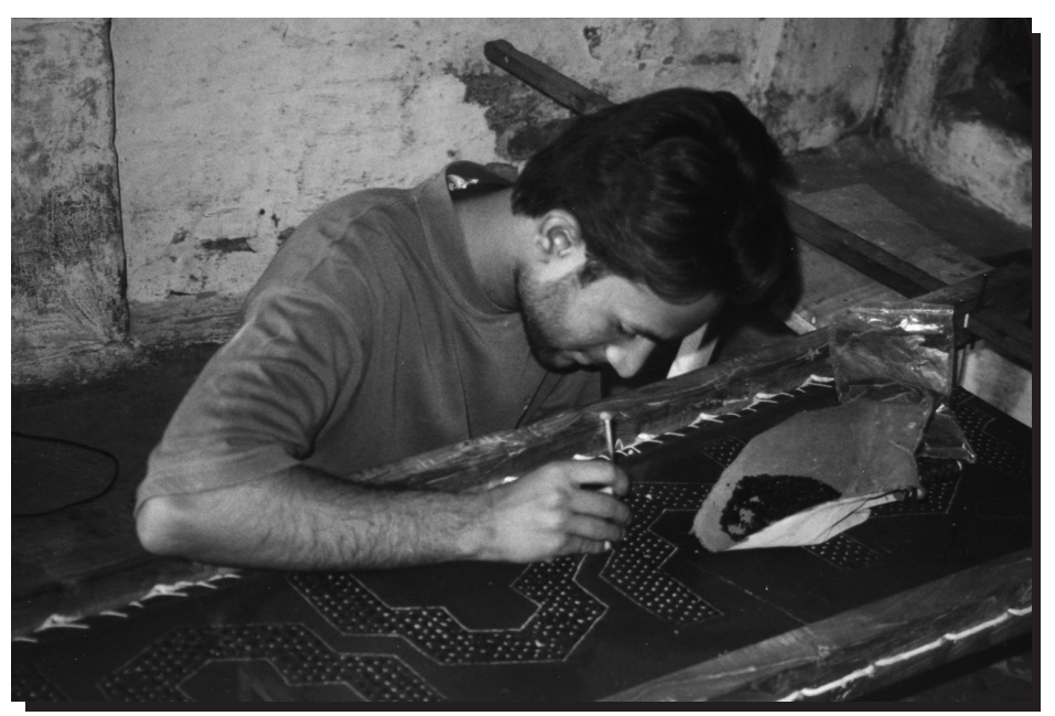
Own-account homebased worker doing needlework in Ahmedabad, India.

workers. Laws that recognise organisations vary considerably from country to country. The first step is the need to recognise the existence and importance of member-based organisations of informal workers by all levels of government but also by international bodies like the International Labour Organisation.