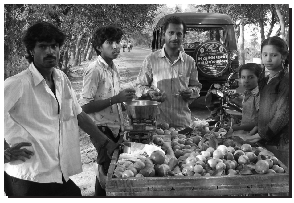
Street vendors selling their produce in Ahmedabad, India.

Individual waste pickers are the most vulnerable as they do not have any supportive organisation or network to turn to. In Pune, waste pickers participating in this study are involved in highly organised waste-recycling schemes and some sell waste through their own co-operative. <sup>48</sup> The drop in prices of various recyclable goods reported by these respondents ranged from five to seven per cent. In Latin America, where a lower percentage of the sample was involved in these kinds of recycling schemes, the drop in prices of various recyclable goods over the same period ranged from 42 to 50 per cent. Whether this contrast is due to the level of organisation remains an empirical question that needs further investigation.