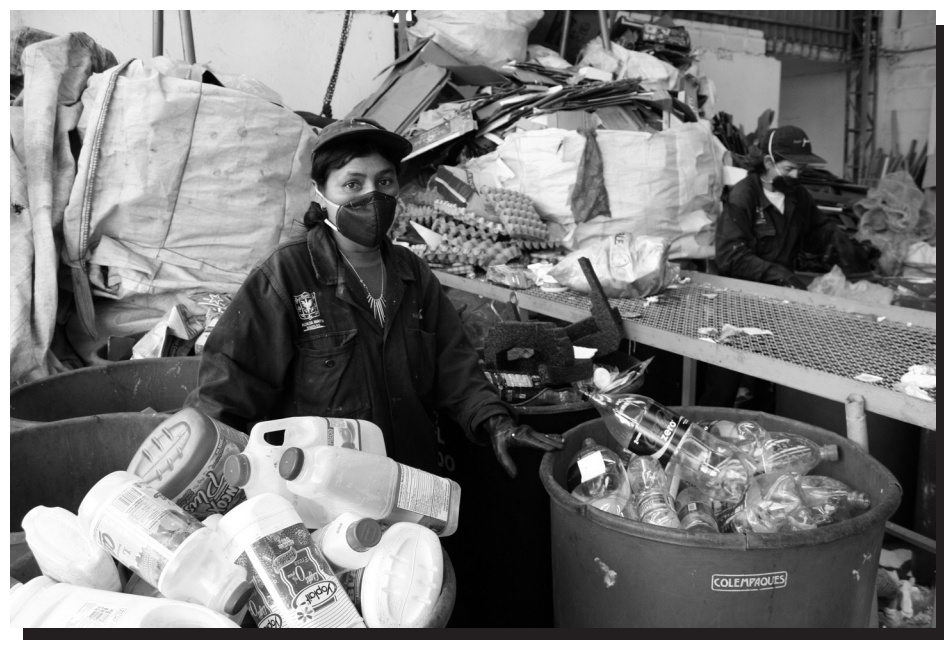
Waste picker sorting material at the Alqueria Recycling Centre in Bogotá, Colombia.

However, a higher number of informal workers does not mean they are thriving. On the contrary, respondents were clear that they faced greater absolute numbers of competitors for fewer customers over the same period, and this had decreased their revenue substantially. Of the street vendors, 80 per cent reported that they had experienced increased direct competition from new vendors selling similar goods. Over two-thirds (655) of home-based workers, who are most likely to work in isolation, reported increased direct competition. One home-based worker reported that she used to sell her products at 199 Baht (USD 6) but her new competitors were willing to sell as low as 59 Baht (USD 1.7) and she now faces a 50 per cent decrease in her income. Some of these new competitors were migrant workers who were willing to sell at the lowest prices.