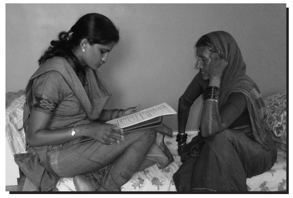
Waste picker being interviewed in Pune, India.

study of the impact of the crisis on all three groups. Some findings from the SEWA study are also included in this report.