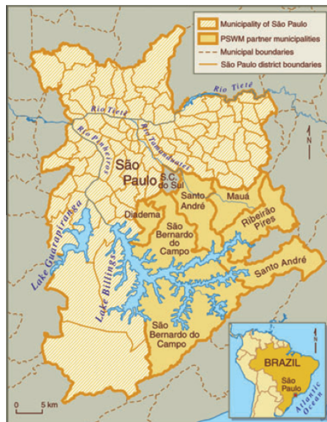
Fig. 1. Map of the study area in Brazil. The map shows Ribeirão Pires within the Metropolitan Region of São Paulo; the inset shows the location of São Paulo within Brazil.

Through participant observation, this qualitative phase of the study recorded details of the daily activities, equipment, energy sources, and general operations of the recycling cooperative, including their collection routes, transportation, separation, and processing of the recyclable resources: plastics, paper and cardboard, glass, aluminium, and steel. Structured interviews explored recyclers' opinions about their contribution as environmental service providers, the efficiency of the collection, transportation, and separation activities within the cooperative and its facilities, the