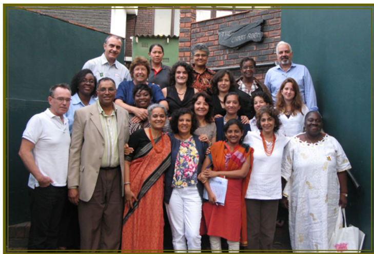
Group photo from the Learning Meeting in Durban.