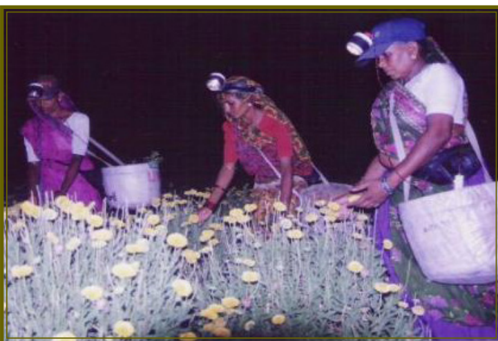
Flower pickers with solar powered head torches working before sun rise.

Through the WIEGO project, SEWA is expanding its OHS work into more sectors of the informal economy – embroidery workers, papad rollers, waste pickers and agricultural workers. Together with Maharashtra Institute of Technology, the