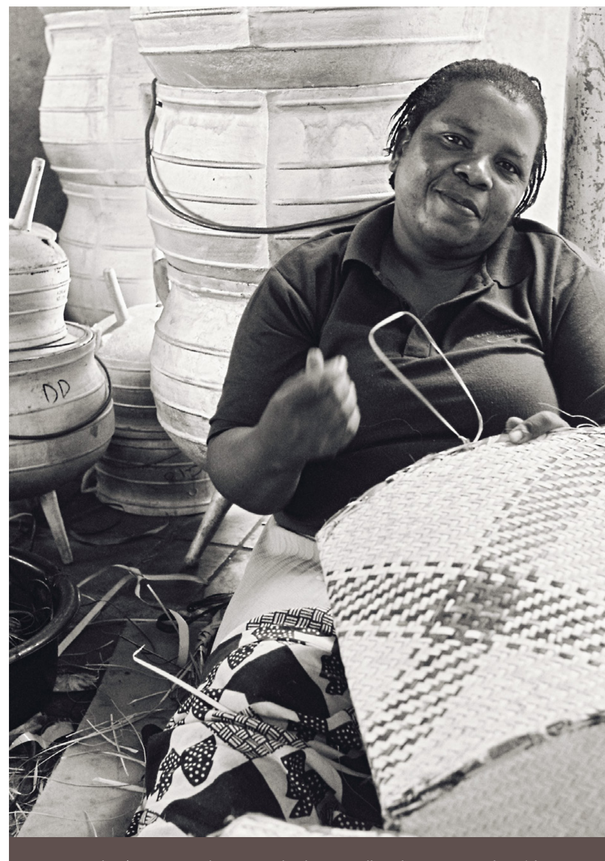
Durban's street vendors weave baskets to sell as these are popular with tourists. Traders in the coastal city have felt a sharp drop in income with COVID-19 restrictions severely hampering tourism.

WIEGO website. 2020. COVID-19 Crisis and the Informal Economy: WIEGO Global Impact Study. Available at: https://www.wiego.org/covid-19-global-impact-study