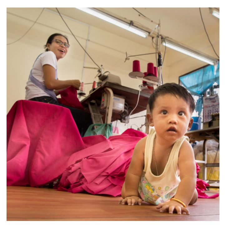
A 6-month-old child plays on the floor of the garment factory where her mother works in Bangkok, Thailand.

A sentiment that arose out of several of the focus groups was that the responsibility for child care should be seen as part of a public, collective responsibility because women simply did not have time to both provide income and adequate care for their children. In Brazil, the research participants suggested that it was the responsibility of the state to support working women with more comprehensive social policies with respect to the care of children. They argued for more child care centres running for extended hours during the day, but also for the provision of additional health and education programmes to compensate for the time that mothers are unable to spend with their children [Brazil FG1]. Indian women who sent their children to the SEWA child care centres echoed these sentiments, feeling that they had neither the time nor the energy to impart good values and behaviour and basic education to their children; they really appreciated that the centres were able to do this for them [India FG Report].