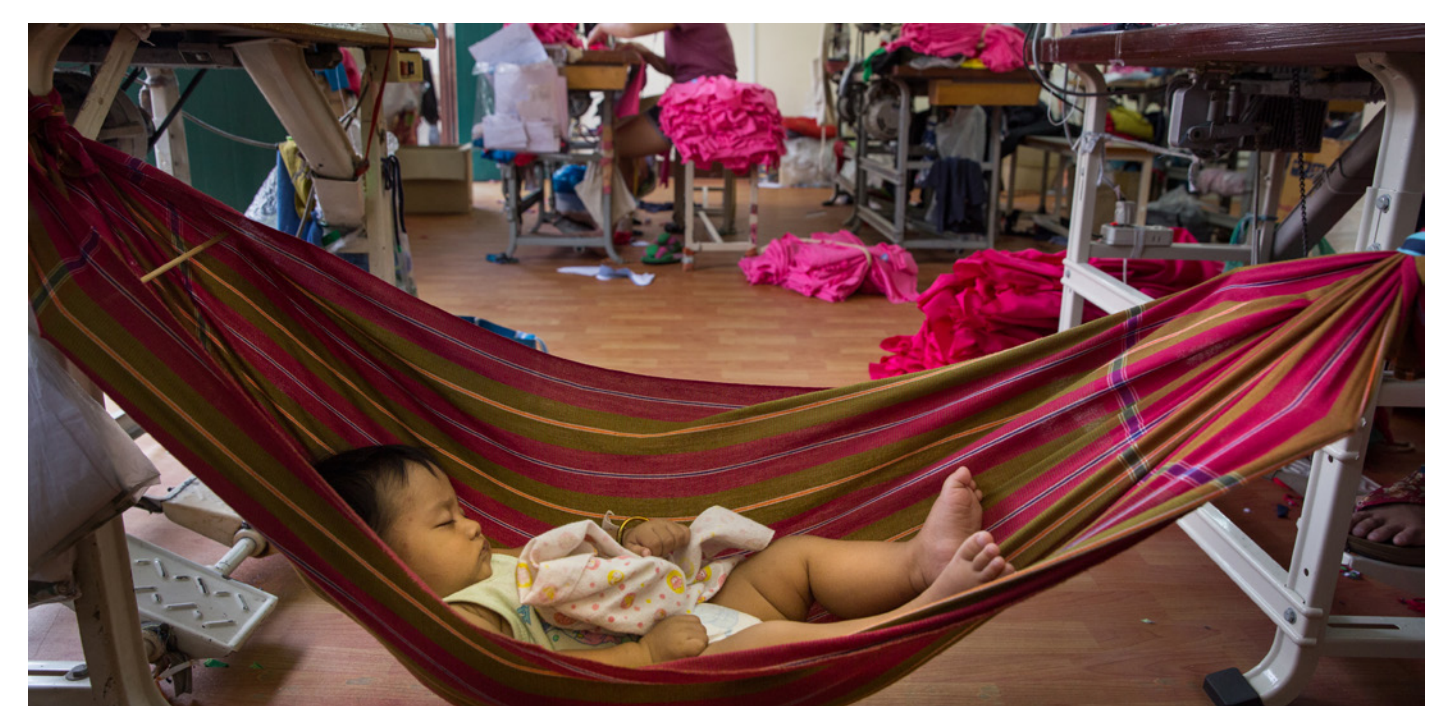
The 6-month-old child of a garment worker naps while her mother sews at a garment factory in Bangkok, Thailand.