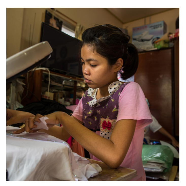
This young girl is helping with her mother with work in Bangkok, Thailand. As is common for many families employed in informal work, her mother is her sole caretaker.