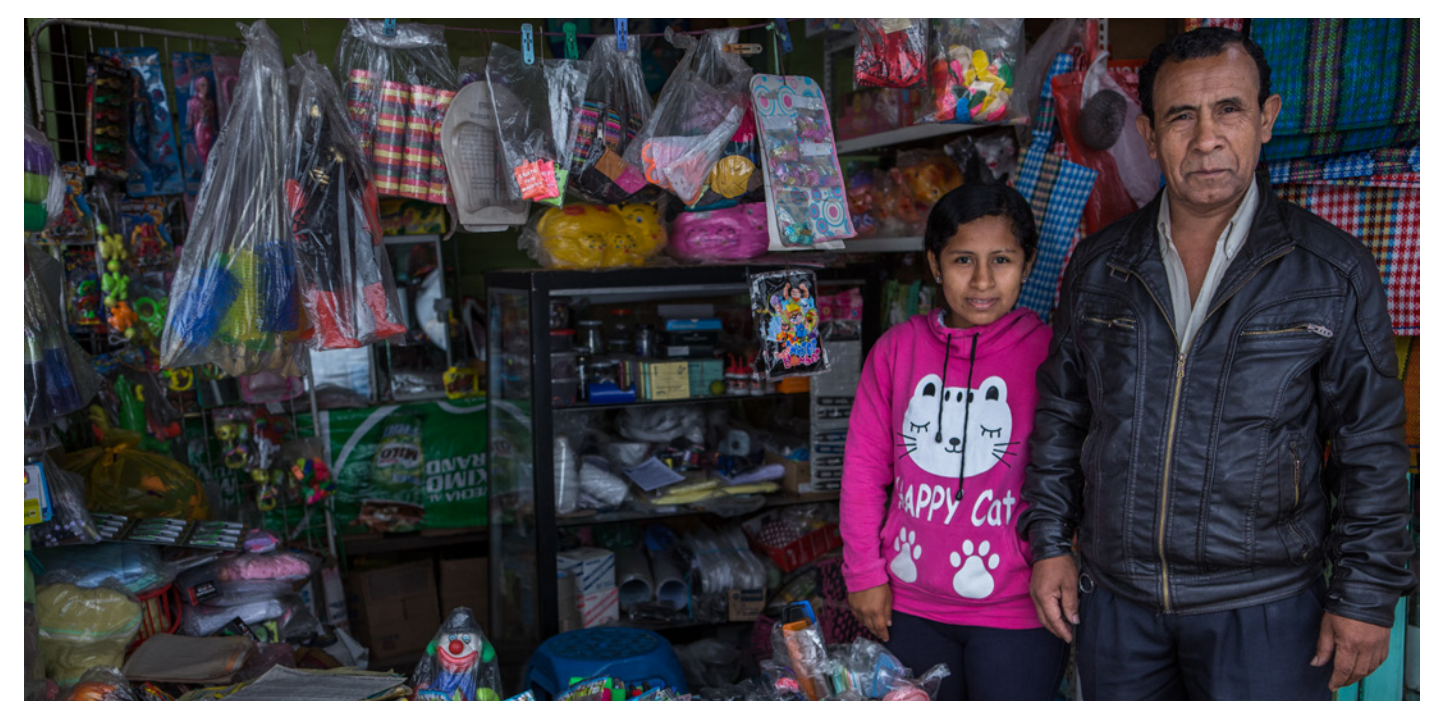
A vendor and his daughter pose for a photograph in a market in Lima, Peru.