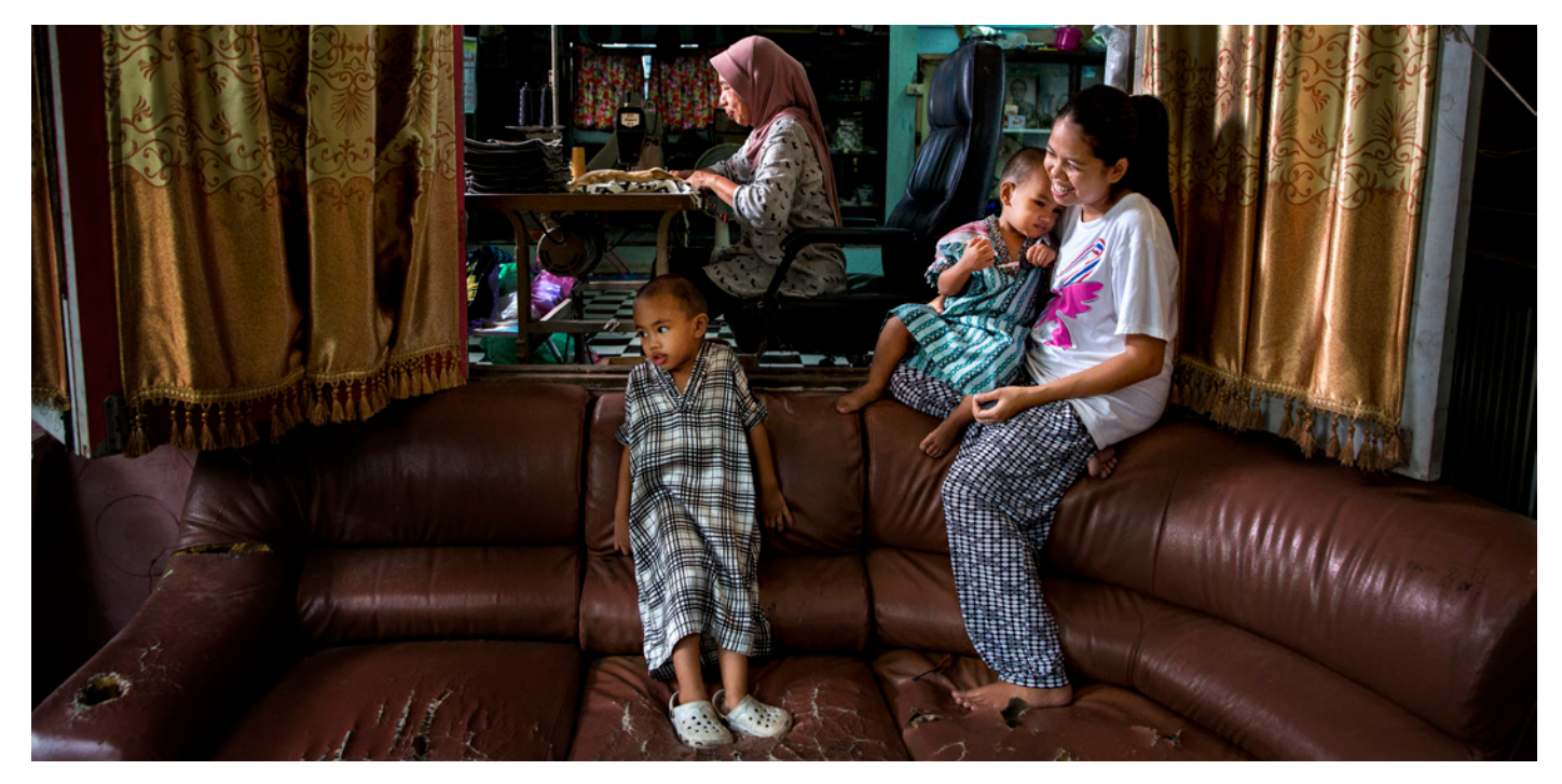
A home-based worker sews garments while her grandchildren play in their home in Bangkok, Thailand.