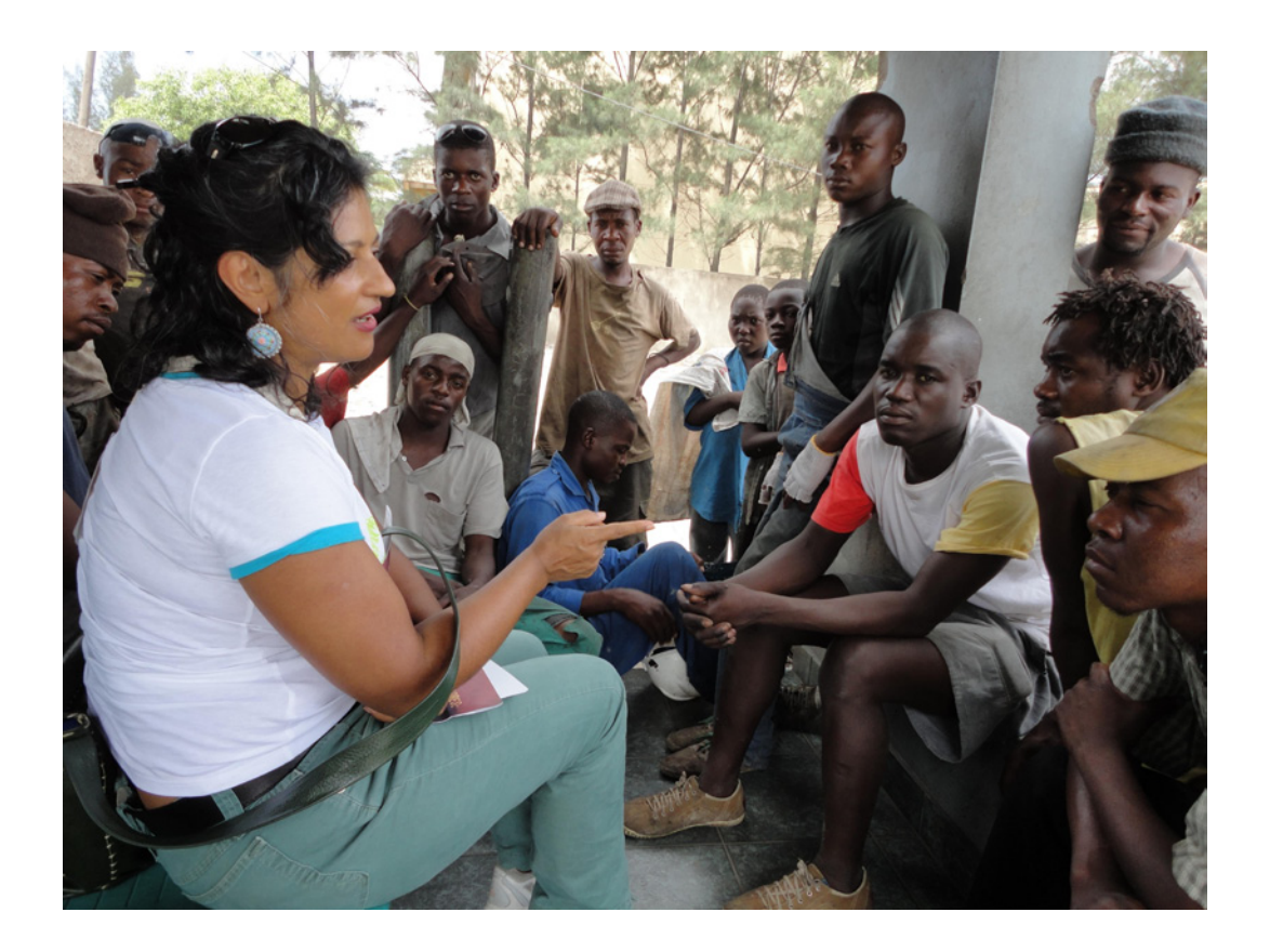
Focus group meeting with Hulene dump pickers