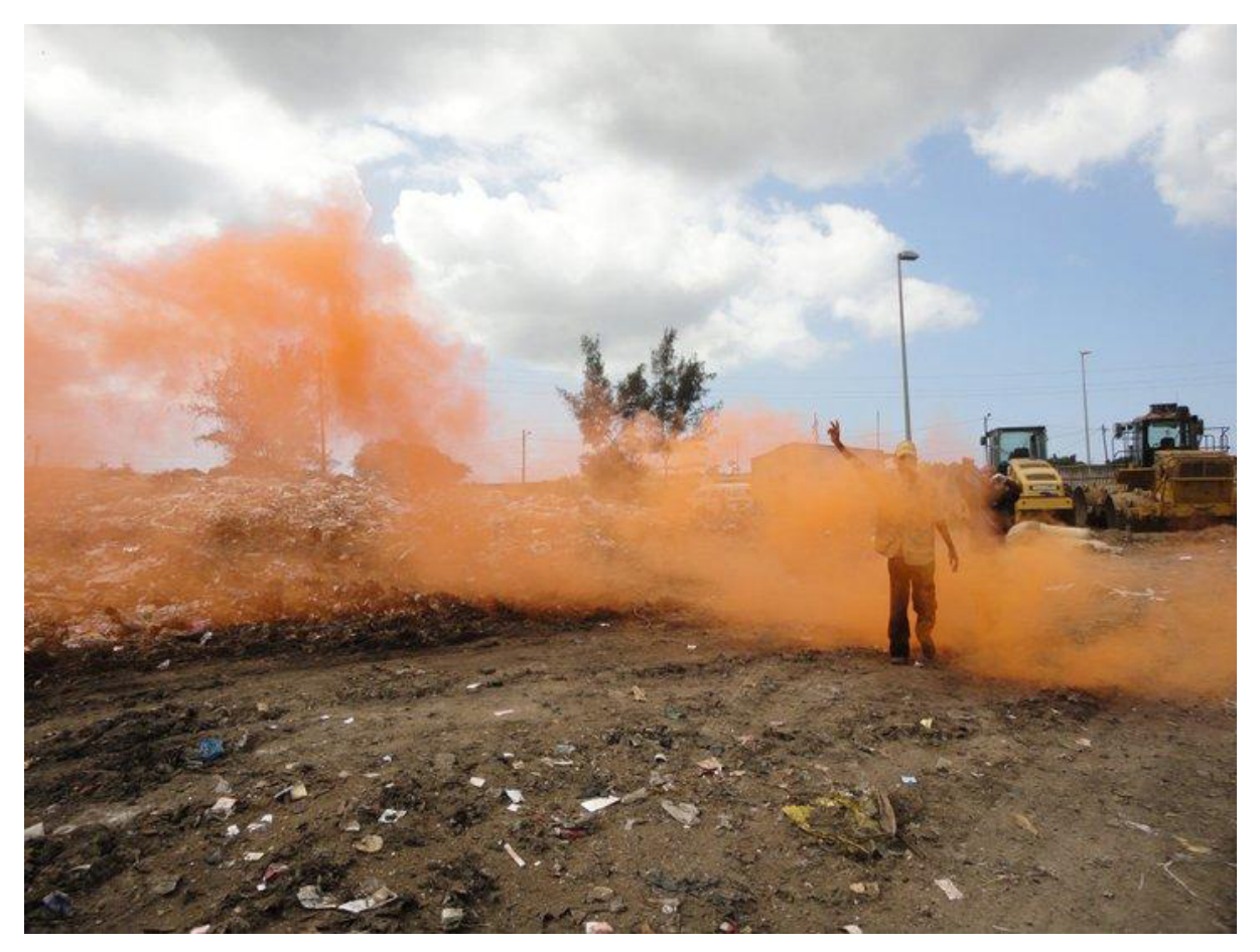
Toxic fumes at the Hulene dump