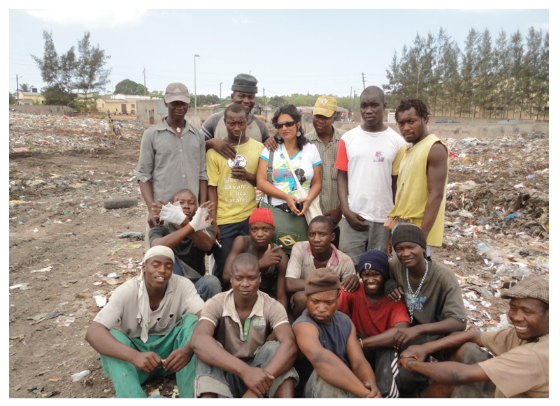
Group photo at the Hulene dump