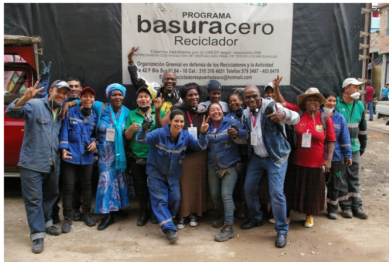
Photo: Exchange participants with waste pickers at Puerta de Oro