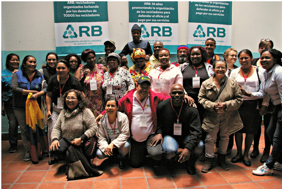
Photo: Exchange participants at the offices of the Asociación de Recicladores de Bogota.

“If there are no borders for those who exploit people, there should be no borders for those who struggle.”