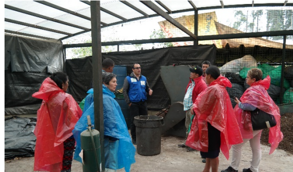
Photo: Participants learn about composting

Ten years ago, the ARB began running the organic waste pilot project in the La Florida Park, through an associative agreement with the government. Through this agreement, the government agreed to provide the ARB with exclusive access to the materials in the park plus a small amount of funding while the ARB agreed to provide the equipment, labour and machines necessary to get the project off the ground.