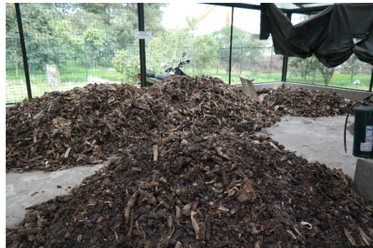
Photos: Food waste (left) which is later separated into piles of compost (right)