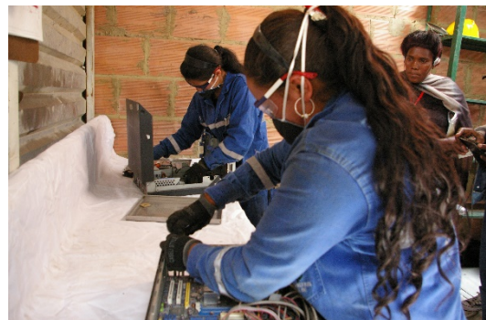
Photo: Members of Puerta de Oro demonstrate how to disassemble computer hard drives

As two women members take apart computer hard drives, separating the mother board, the memory card, the processor, scrap metal, Nelly explains that 100% of the materials at their facility are recycled, “Here, nothing goes to the landfill.” All of the materials collected from their sources (banks, call centres, etc) are brought to the Association where members disassemble and separate the materials. The waste is then weighed, recorded in the municipal payment system and sold on up the recycling chain. The profits from the recycled materials are shared among Puerta de Oro members, with some money being kept to maintain the organization. They are also paid for their waste management services by the municipality as they are part of the payment scheme.