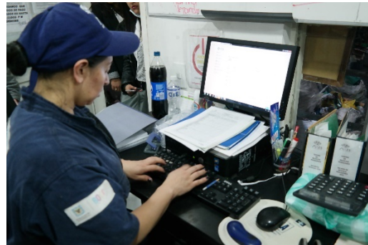
Information from the templates is recorded, tracked and inputted so that waste pickers are paid by the city payment scheme (above)