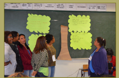
Workshops in the metropolitan region of Belo Horizonte (L), May 2013, and Itaúna (R), October 2013.