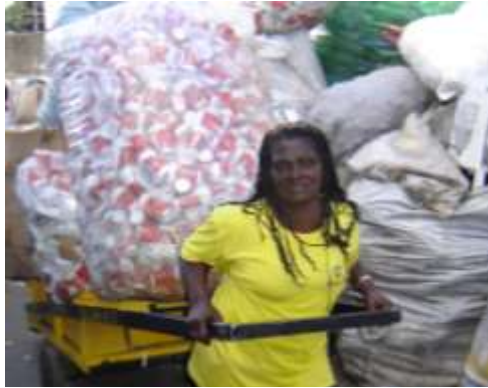
ASMARE member using a push cart for transport of sorted materials.

Two of the eight cooperatives of waste pickers integrated in the municipal recycling scheme collect recyclable materials from commercial establishments and offices, especially in downtown Belo Horizonte, using push-carts. One of these – ASMARE – has its own carpentry workshop where carts are made and or repaired.