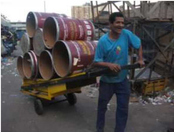
ASMARE catador.

Founded in 1990, ASMARE constitutes a managerial and administrative organisation consisting of associates that pursue a self-supporting business in the recycling field. The association is organised in committees as follows: Infrastructure, Health, Religion, Social Communication, Finances, Environment and Education/Culture/ Entertainment. The Steering Committee is formed by a representative of each one of the 7 committees. Though legally registered as an association ASMARE functions internally as a cooperative.