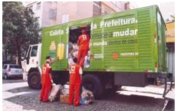
Curbside collection by the Municipality.

The SLU started this system in 2003. The system has increased its target population from 80,000 persons in 2003 to 148,000 persons in 2008, when 3,900 tons of recyclables were collected either directly by SLU or third parties contracted by SLU . Initial focus was on Central and South sectors of the city where presence of recyclables was higher, according to the SLU "Waste Characterization and Generation Studies" carried out in 1985, 1991, 1995 and 2003. The collected materials are taken to warehouses run by cooperatives of semi-formal waste pickers where the materials are further processed, after which they are sold to industry.