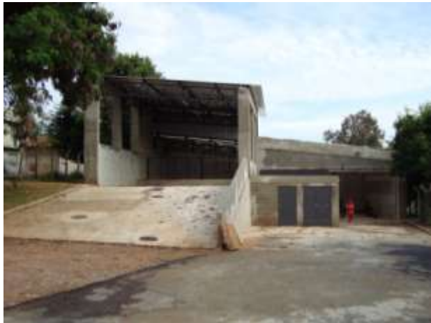
Coopersoli Barreiro recycling warehouse – ramp leading to discharge area for recyclables.

Collected recyclable waste materials are brought to the recycling warehouses of one of the eight waste pickers' cooperatives, where the materials are sorted, baled, shredded, packaged, and stored. Most recycling