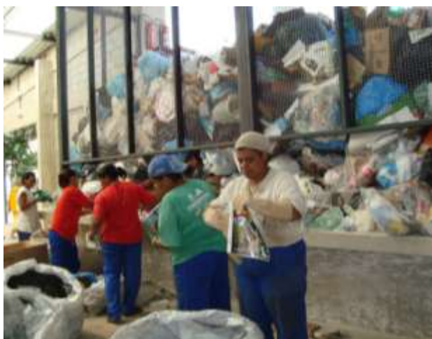
Coopersoli Barreiro recycling warehouse – sorting devise.

warehouses function in areas that were adapted to the activity and therefore are not always suitable for this type of activity. New warehouses are being built properly designed for recycling activities with mechanical discharge and sorting systems, better suited for waste pickers' requirements.