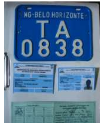
Plate used for the horse carts of carroceiros .

Municipal Decree 10.293 (12/08/2000) determines that horse carts should be registered and licensed on an annual basis without any charge to the informal workers. The informal collector of debris is provided an identity card and a vaccination card for the horse is also provided by the Municipal Secretariat for Health. The SLU is responsible for monitoring compliance of disposal of material collected and transported by the carroceiros according to the regulation.