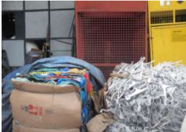
Collected materials sorted by type.