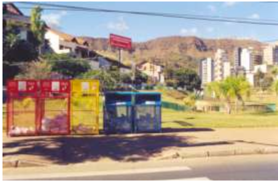
Drop-off receptacles.

This system consists of 150 delivery sites distributed throughout the city – locally known as Local de Entrega Voluntaria (LEV) – where the population can deposit