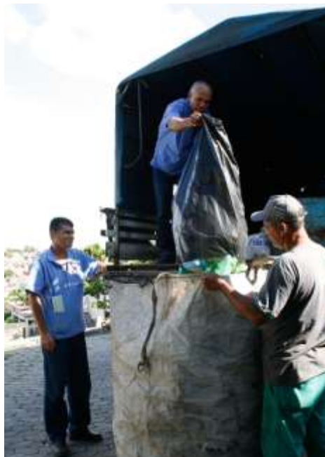
Catadores at Cataunidos.

Operators of the plant are hired in the local community by the Cataunidos. Three waste pickers are the managers of the plant. There is a committee with representatives of the 9 waste pickers’ groups which oversee the management of the plant. There are 15 workers at this site.