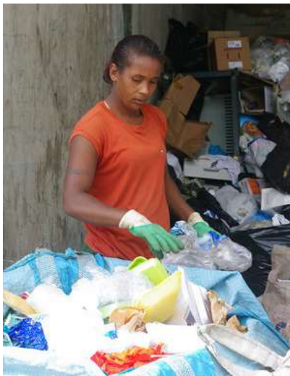
COMARP member.

COMARP was formed by 10 people, mainly women, in 2003 following a capacity building activity developed by the municipality to boost social enterprises in the Pampulha region of Belo Horizonte. The group decided to form a cooperative and engage in the recycling business. Initially the group engaged in the collection of recyclables and in the assembly of brooms from PET bottles as a way to generate income but now they have concentrated activities on the sorting of recyclables. Since its beginning the group has received support from the municipality which has provided an area for the cooperative's first sorting facility.