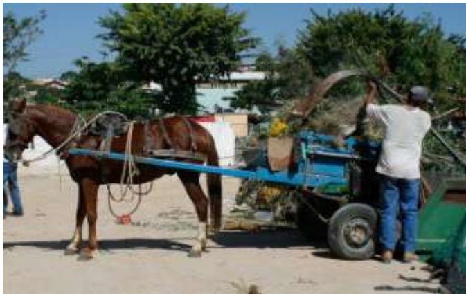
Unloading debris.

Carroceiros use horse-drawn carts to transport collected construction debris. Formerly, most of the construction waste collected would be disposed off in illegal dump sites, attracting additional illegal dumping