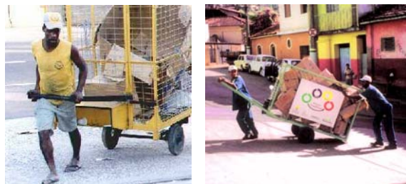
Street pickers-Nova Lima-MG

A National Training Programme was started whose innovative character lies in the coordination of the various sectors involved in waste management, where each part continued to take up its specific responsibility, though within a framework of integrated work which enabled each institution involved to acquire an overall