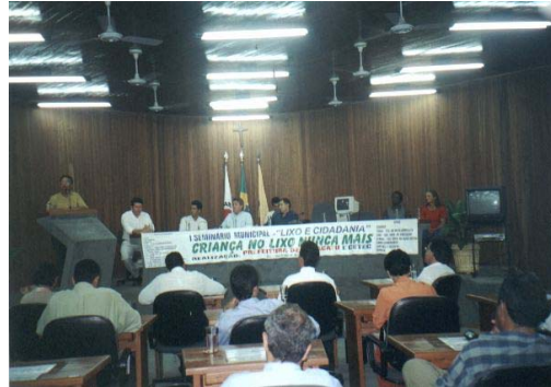
A seminar organized by the Municipal Waste & Citizenship Fórum of Paracatu City (Minas Gerais State)

The whole process of organising the waste pickers into associations or cooperatives, as well as the creation of Waste & Citizenship Forums in the municipalities, is very slow. Around 100 Municipal Waste & Citizenship Forums have been created, so far, in the whole country out of 5,507 municipalities. This