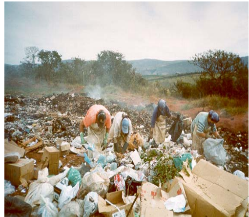
Pickers at a dumpsite

Some of the initial actions developed by the National Forum were: (1) a national mobilization campaign; (2) a pilot programme for the implementation of the first experiences of Municipal Waste & Citizenship Forums in the country and (3) the development of a National Training Programme in Urban Waste Management.