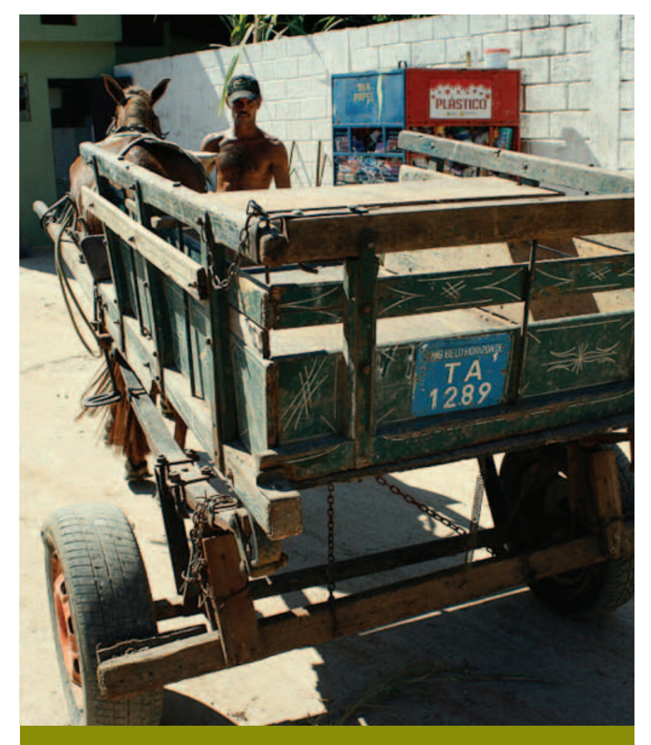
All informal workers must be liscensed and register their horse carts every year free of charge to receive an identity card and vaccination card for their horse. Further veterinary support is also provided from the Veterinary School of the Federal University of Minas Gerais.

The Programme has a number of components.