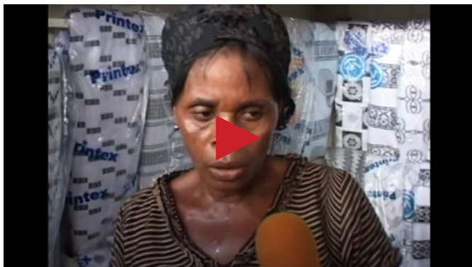
Makola Market Vendors on the Challenge of Fires.