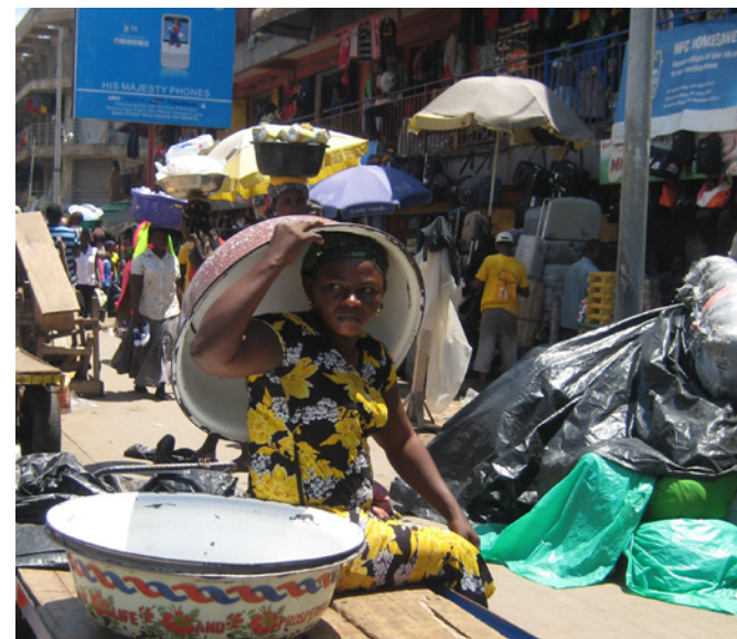
A kayayei (head porter) sheltering from the sun.

Through the workshops, the traders have also come to the realization that they need to be represented directly within the local government structures if their voices are to be heard and their issues addressed. For this reason, in the 2010 Local Government Elections, one executive member of the Ga East Traders Union stood to be elected as an assembly member of the Ga East Municipal Assembly. Though she lost the elections, the union lobbied for her to be one of the 30 per cent of assembly members that the government appoints. Now she is a member of the Gender and Children Sub-committee of the Assembly. Another member was elected as a member of the Unit Committee (community level structure of the local government system). As a result, he is representing his community on the Area Council and is secretary to the development sub-committee. Through these two executive members, the traders unions' interests and issues are brought to the fore at the municipal assembly and area levels, which partly accounts for the successes they have won so far.