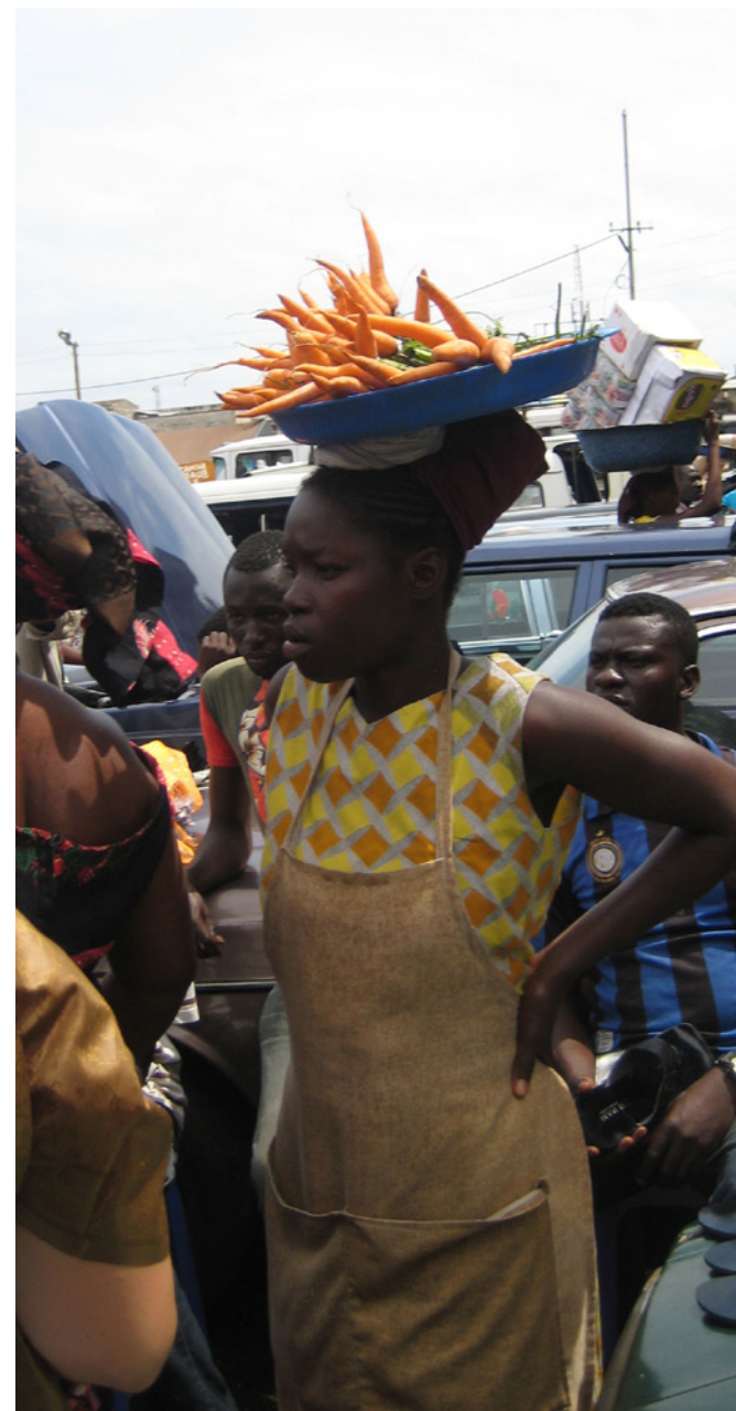
A woman working as a Kayayei, a head porter, in the Accra market.

In addition to the workshops, WIEGO and ILGS organized dialogue sessions between the traders and vendors on one hand and service providers and local government authorities on the other hand. To start with, as part of these workshops,