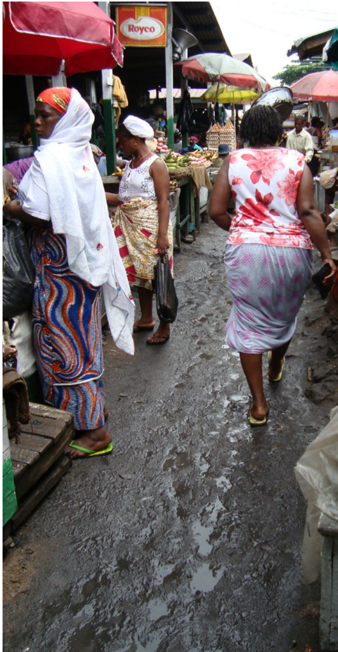
A rainy day for Accra market vendors means a muddy trek for their customers.

they organized “clinics” with some of these officials by inviting a local government financial expert to have in-depth discussions with the traders on how to deal with officials of the Ghana Revenue Authority in relation to income tax and VAT. They also invited the Chief Budget Officer of a local government authority who explained to them the functions of the local government and the relationship that should exist between traders and their local government. Outside the workshops, WIEGO and ILGS organized dialogue sessions between the traders and officers from the National Board for Small-Scale Industries, the Ghana Revenue Authority, the Accra Metropolitan Assembly (AMA), the National Health Insurance Scheme (NHIS), the Informal Sector of the Social Security, and the National Insurance Trust.