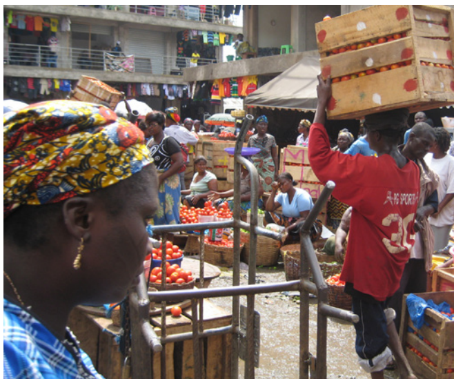
The often cramped layout of Accra informal markets leaves workers vulnerable to a variety hazards: illness, crime, fire, police harassment, and so on.

and income tax) that informal workers must pay to their local authority (Local Government Act). Although these monies place a large financial burden on informal workers, they supplement the District Assembly Common Fund (DAFCF), which the local authorities receive from the central government. They are therefore seen as monies meant for development in general but not for providing services to the traders or for improving their working conditions. This point was made in a 2003 Auditor-General’s Report, which read “there are no preventive maintenance schemes in place due to lack of funds since revenue from the markets are lodged in a common fund of the Assembly and used for other purposes.... AMA seems to regard the markets as a principal source of