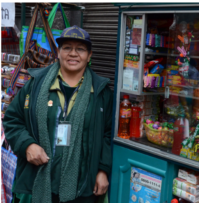
Photo from Lima