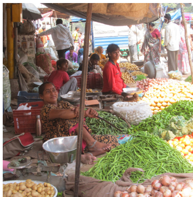
Photo from Ahmedabad

Regulations should not grant discretionary powers to police officers to set fees or fines. Capacity building