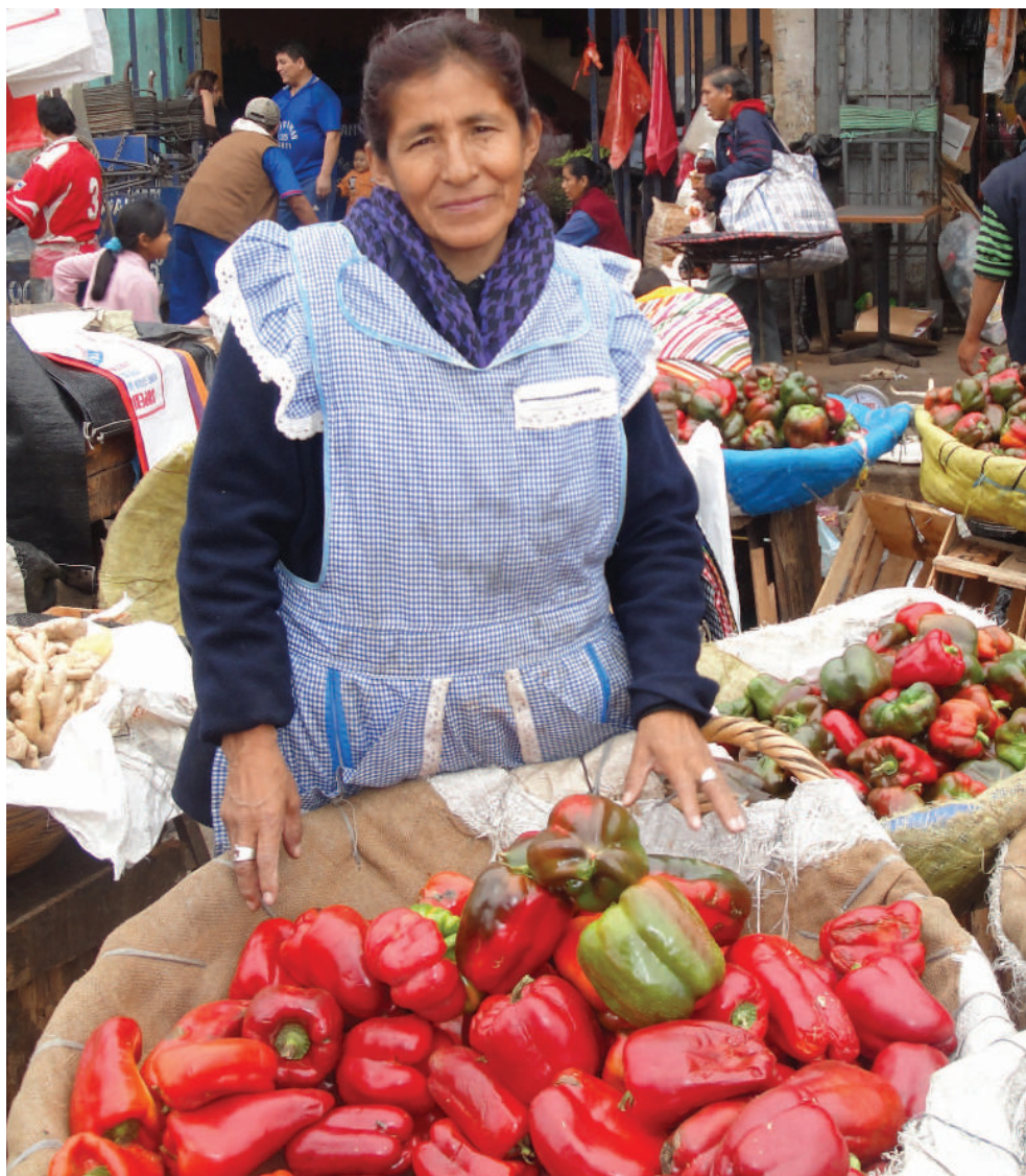
The Women's Network of Street and Market Vendors (Lima, Peru) combats the under-representation of women in leadership positions within street vending organizations.

One promising example of a new model is the Women's Network of Lima. Women represent two-thirds of all street vendors in Lima, and yet very few women hold leadership