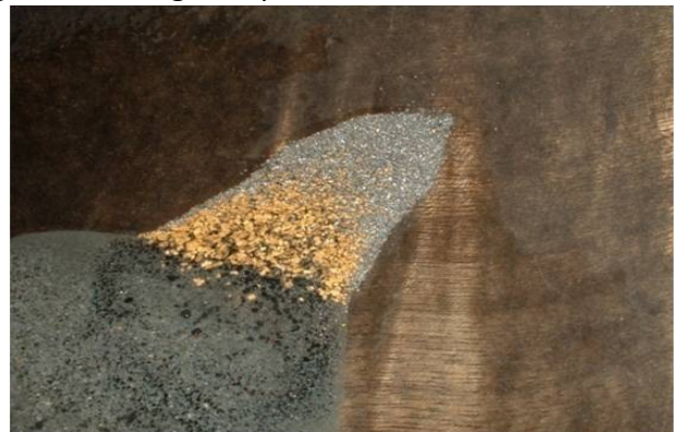
Panned gold with associated platinum.