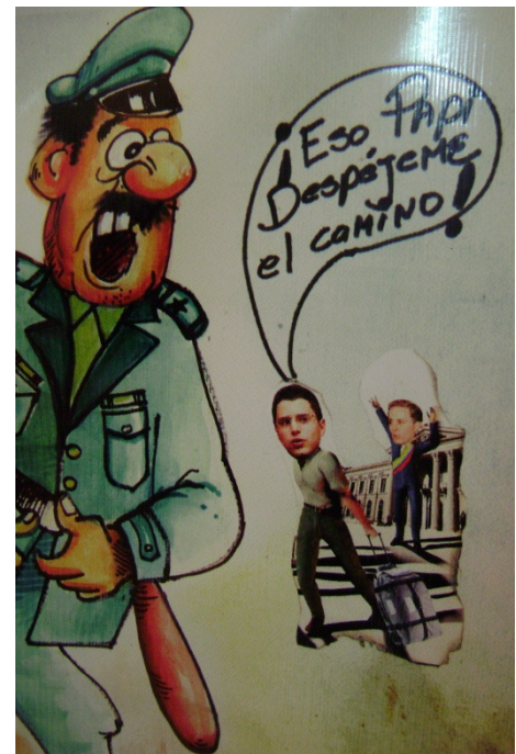
Waste pickers' Banner: "That's it Daddy, pave me the way"

Besides the Urbes and other intensive capital companies and even philanthropic foundations, other actors present around the waste trade are homeless and mendicant individuals who rummage for materials for their personal use and, sometimes, for sale. IDPs, recently displaced to urban zones from their rural homes, often turn to waste picking, just as the grandparents of many of today's waste pickers once did, because trash remains one of the resources that is readily available to those who have nothing. These and other poverty-trapped individuals, including the recently unemployed, will find themselves in waste picking: the low entry to barrier makes the trade both easy to access and does not demand many skills or capital investment, although earning a regular income does require trade knowledge. These occasional waste pickers much like the waste pickers who are working in the trade regularly and unlike big recycling business, did not enter the waste market by choice, but by a lack thereof.