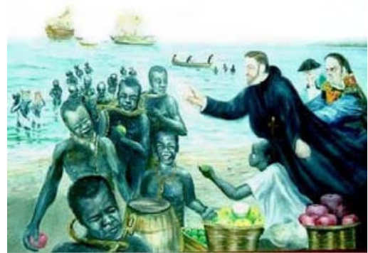
Painting of San Pedro Claver in Cartagena de Indias.

The first Africans that arrived to Colombia were mainly from the Guinean river zone, Cape Verde and the lands between Senegal and Sierra Leone. In later years, Africans were enslaved and trafficked from the Volta river region around what are known today as the countries of Ghana, Togo, and Benin; and, later still, Africans from the island of Tome, and the countries of Congo, Angola, and the old kingdom of Kongo, were brought to work in Colombia. 60 Their presence grew significantly over time. In 1618, the