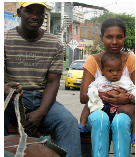
Carolina La Monty®

As a consequence of women's presence in waste picking, children of waste pickers are often born and raised within it. In the absence of neighbors or family members who can afford to stay at home, many of these women will be found breastfeeding or otherwise accompanied by their children. Leaving their children to watch over each other – whether in the dumps or the slums – is a less attractive option for these mothers, especially as they consider the dangers and risks of their living conditions as poor, excluded and the most vulnerable of society. 121 These include, among other things, the very real possibilities of being forced into sex trafficking, drug trafficking or being exploited in armed conflict, as well as the dangers of domestic accidents associated with living in makeshift, unregulated housing structures, precariously placed on the edges of eroded mountain ranges. Yet, unlike children working in mines, the children in waste picking do not bring any particular utility as children per se ; it is their constant presence that draws them into the work. Further, since the trade does not require any particular skill or strength so as to preclude their participation, children may be found separating material by color and type, watching over collected or salvaged materials, driving the horse-pulled carts or otherwise helping their mothers in related activities.