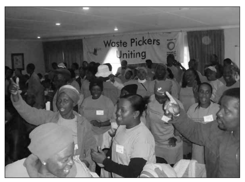
Delegates at the First National Waste Picker Meeting