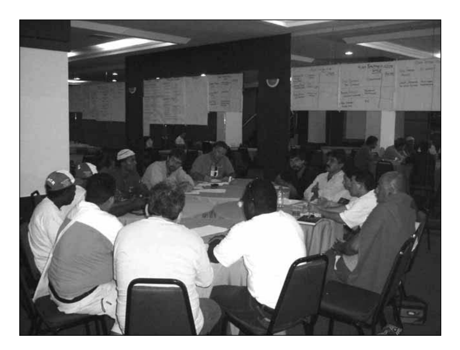
First meeting held at the World Social Forum in Porto Alegre, February 2005

When the Inter-American Development Bank held a conference on 'Improving the lives of Latin American and Caribbean waste segregators' in Buenos Aires, Argentina, the LAWPN decided to participate in order to give voice to waste pickers at the event. An important parallel session took place where leaders involved in the LAWPN shared information about the network with new organisations.