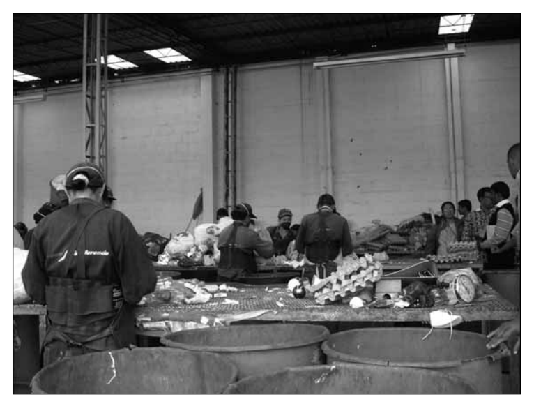
Alqueria Recycling Centre, Bogota.