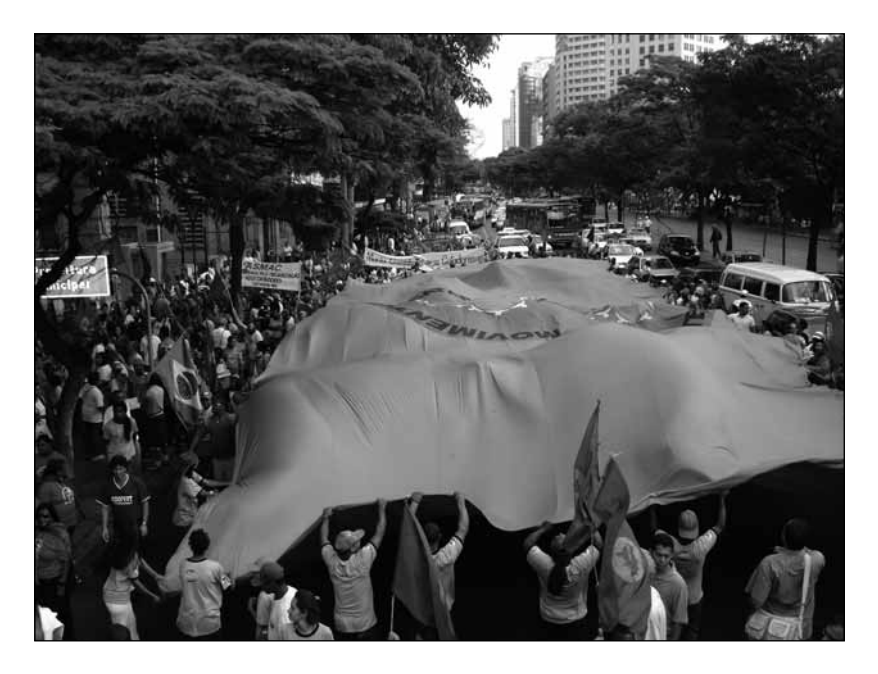
MNCR Brazil, march against privatisation

Forum of Studies on Street Dwellers with the support of the Pastoral de Rua , the Belo Horizonte municipal administration and many other organisations (Dias and Alves 2008, 9-10). In June 2001, the National Movement of Catadores (MNCR) was founded by the more than 1,700 catadores who attended the first National Congress of Catadores held in Brasilia (www.mncr.org.br).