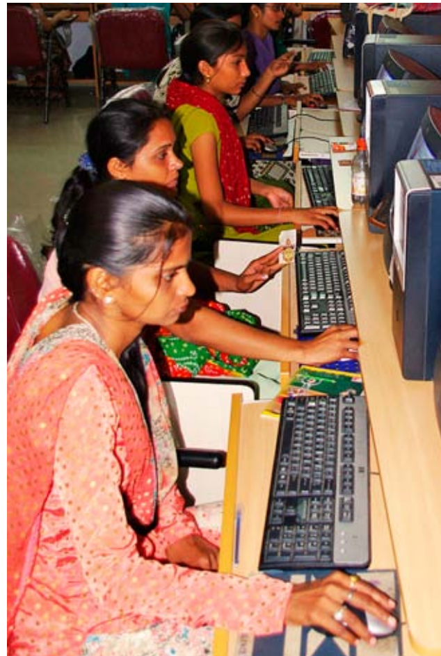
SEWA has been running classes to help its members gain new production, marketing and business skills.

Compounding the very low average wages of the home-based workers is the fact that homeworkers have to pay for many of the non-wage costs of production: notably, the overhead costs of some, or all, of the raw material. The ready-made garment workers in Ahmedabad get raw material from the employer/contract, but have to purchase thread from the open market with their own money. During the festival season, when the workers get more work, the thread shop owners also increase their price, thus eating into the income of the worker.