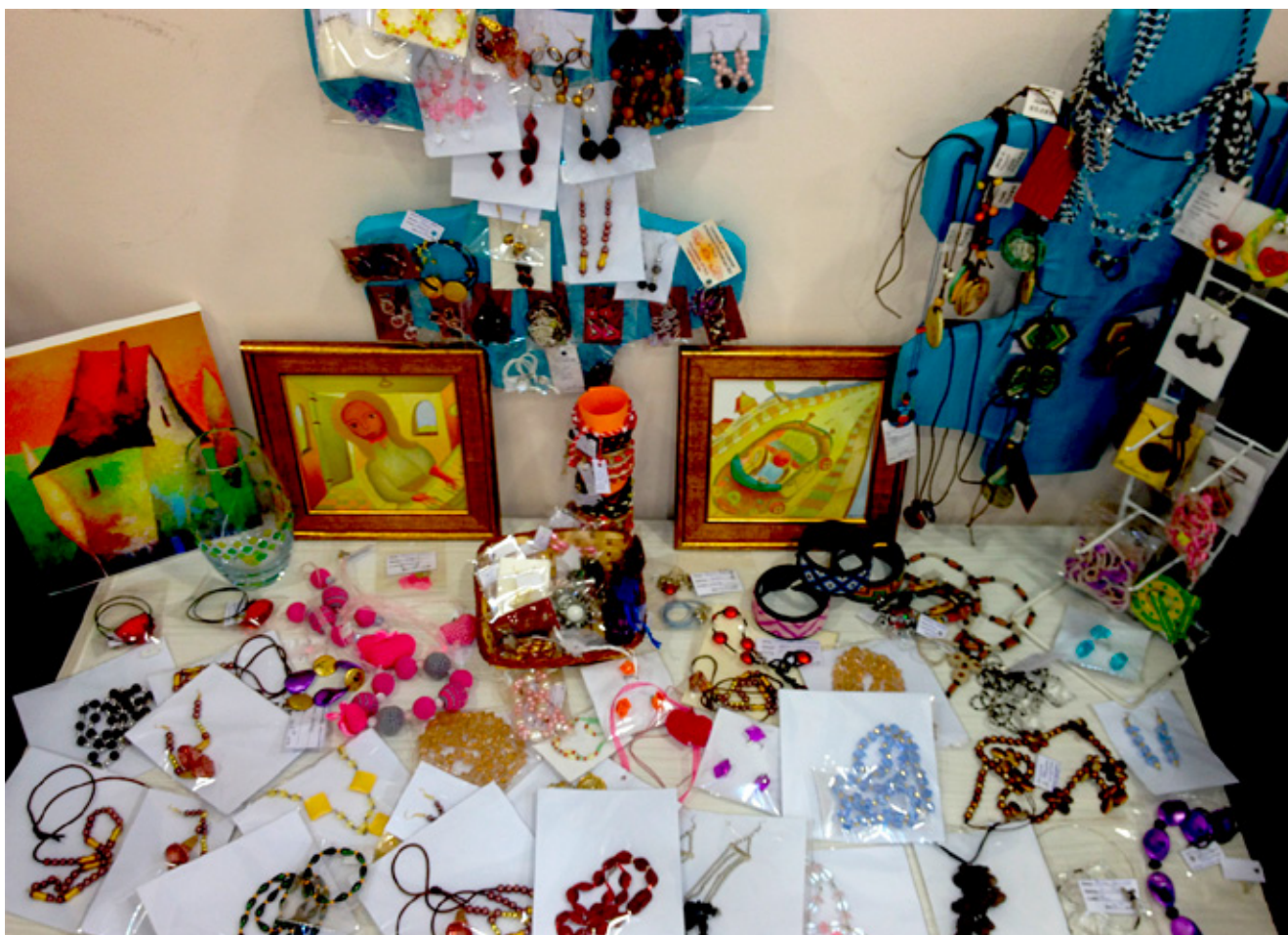
A colourful display of products at the Ruse shop showcases local craft.

efactor of the Association—gave the Association the use of a small three-story building with a new shop on the ground floor. More than 70 per cent of Association members, particularly the artists, depend on the shop to make an income. The shop takes 20 per cent of the stated price on merchandise towards the Association's costs. Generally, incomes in Ruse are low—suggested to be an average of BGN 400 (US $250) per month—but home-based workers may have to survive on half that amount.