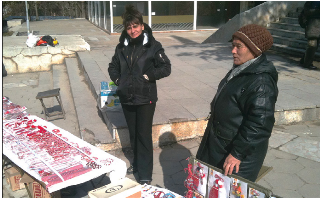
Some Association members sell their products directly on the street.

The Pleven Association, for example, endeavours to maintain cultural traditions by demonstrating and teaching craft skills such as weaving and garment-making to young children. The program is currently trying to raise money for a professional standard weaving loom. The Association also works closely with the cultural centres in the 120 villages in the province, demonstrating crafts (bread-making etc) at local fairs, festivals and public celebrations. These centres are remnants of the former regime—large meeting halls, social clubs, and offices built in each village during the 1960s and 70s, now very neglected, but still playing an important function in village communities. The Association has representatives in every village, thus forming a province-wide network. There is a revival of folklore groups, traditional choirs, dancing, and rural folk festivals, which match the Association's craft products very well and provide a good market for sales. The resurgence of interest in dancing and the fashion for traditional dress at weddings fuel demand for traditional costumes made by Association members.