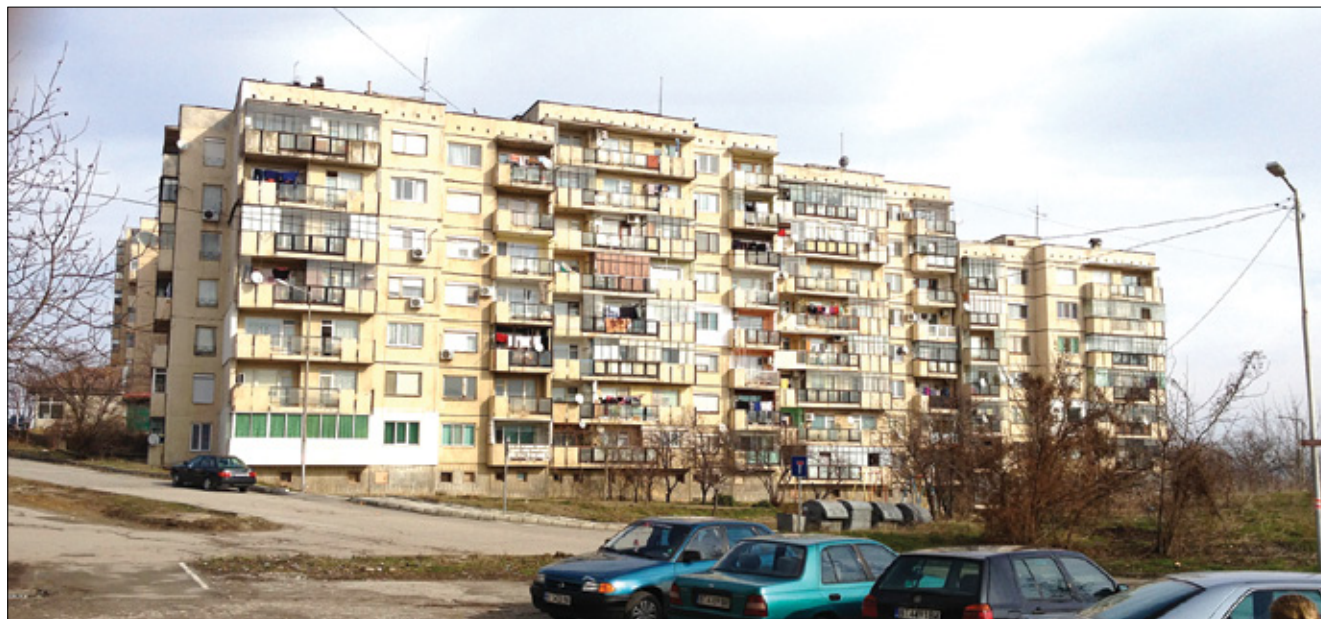
Typical housing for many home-based workers in Veliko Tarnovo