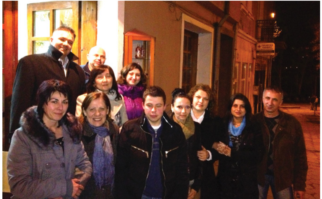
Activists outside the Veliko Tarnovo shop.

making these paper bags in Petrich (by 2013, this had reduced to 1,200 after the employer switched production to a town with a predominantly Muslim population where the Association finds it very difficult to organize the workers).