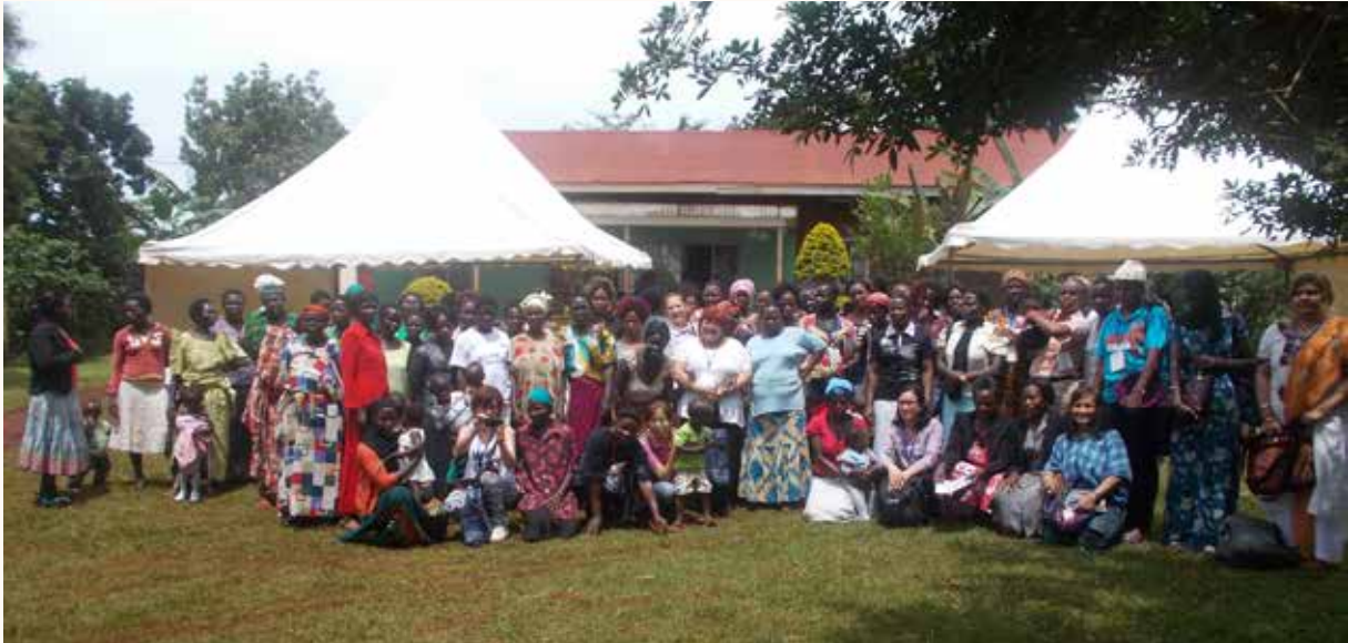
Participants from Chile, Argentina, Thailand, Pakistan, Ethiopia and Kenya participated in regional workshop in Kampala, Uganda and visited home-based worker groups in rural and urban areas. Photo of field visit to Nurturing Uganda

In addition to the above, towards the end of 2015, WFTO Africa & Middle East reported at the Kampala workshop that UGAFAT had already begun sharing the findings of the mapping and policy analysis in the sensitization and training forums being conducted as part of WIEGO's Global Trade Programme. They have begun to introduce the concept of home-based work through these trainings and there are plans to continue taking this work forward.