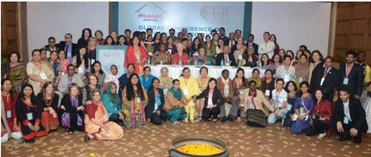
Participants at the global Conference on home-based workers, 2015.

Global networking was further encouraged in February 2015 when participants from five regions (Africa, Latin America, South Asia, South-East Asia and Eastern Europe) came together in New Delhi to participate in the first ever Global Conference on Home-Based Workers. Over 100 HBW leaders and their supporters (the majority women) met to discuss the situation of HBWs in five regions of the world, their challenges, achievements and plans for the future. They also participated in field visits to SEWA Bharat and Ruaab Artisans Collective 36 to learn about good practices in organizing and livelihood development. A key component of the Conference saw participants work together to draft a Global Declaration on Home-Based Work. The approved Declaration – the Delhi Declaration – sets out the main challenges and demands of HBWs around the world and calls on HBW organizations, trade unions, governments, and development agencies to take action in promotion of home-based worker livelihoods and rights. The Declaration was debated line by line and eventually unanimously adopted at the conference after it was put to a vote. HBW leaders then prepared a 5-year action plan with activities outlined at the local, national and international level (WIEGO, 2015). The Conference helped build solidarity between regions and served as inspiration for some of the newer movements to continue or begin their work organizing HBWs in their home countries.