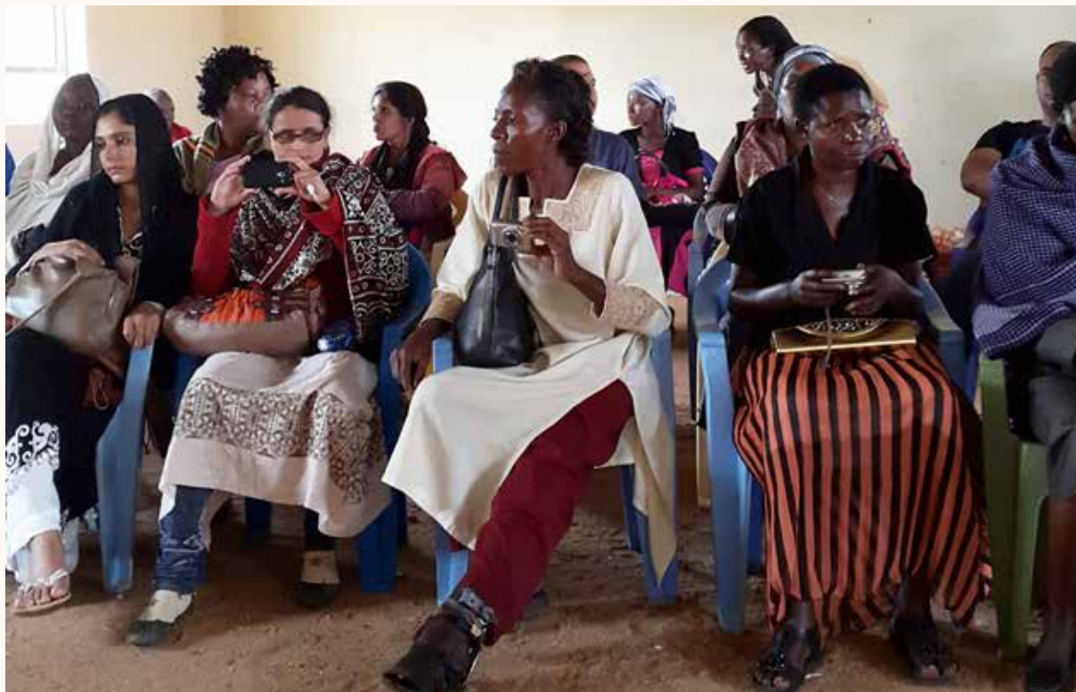
Visit in 2014 to Malembwa Womens Group, Kenya

As a result of the 2014 workshop, KEFAT and UGAFAT (both of whom were also participating in the WIEGO's Informal Women Workers in Fair Trade project), agreed to update baseline studies done in 2013. In 2015, this was done in Kenya and Uganda with a view to develop a comprehensive database on the status of HBWs and their organizations. Using the geographical areas touched by the WIEGO Fair Trade Project, KEFAT surveyed an additional 36 individuals/organizations and conducted a policy analysis to understand the laws affecting HBWs. The findings of the mapping and policy analysis were later shared with approximately 76 HBWs in four sensitization and training forums. Although this activity took place towards the end of the project, it represented an effort to begin to build the organizing, leadership and advocacy skills and capacity of women HBWs in Kenya.