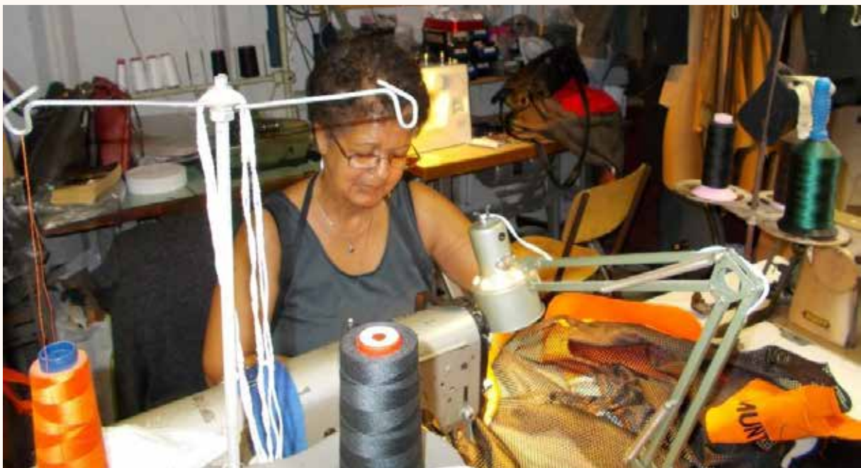
Machinist working out of a garage, Athlone Cape Town

Through desk-based research, 27 organizations with connections to home-based workers were identified, and, unlike other African countries which were part of the project, three organizations that were actively organizing home-based workers were identified. 7 A preliminary analysis of the work conditions of HBWs was accomplished through a review of case studies revealing that home-based work is widespread across several sectors. The analysis and review of literature also revealed the challenges that HBWs face in South Africa: low and irregular earnings and wages, no access to social security benefits, and lack of access to health and safety equipment which can in turn lead to health hazards including aches and pains and fatigue (Castel-Branco, 2013). Lastly, the mapping explored the regulatory framework for home-based work, revealing that while protections and standards implicit regulate homeworkers, no labour standard exists for self-employed HBWs (Castel-Branco, 2013).