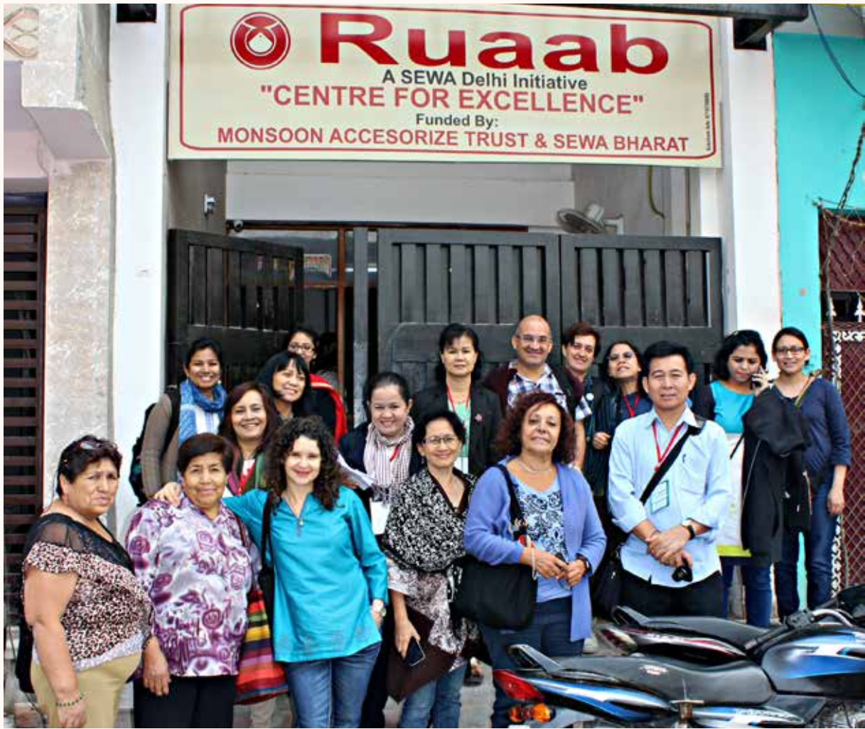
Home-based workers representatives visit to Ruaab SEWA in Delhi, India 2015.