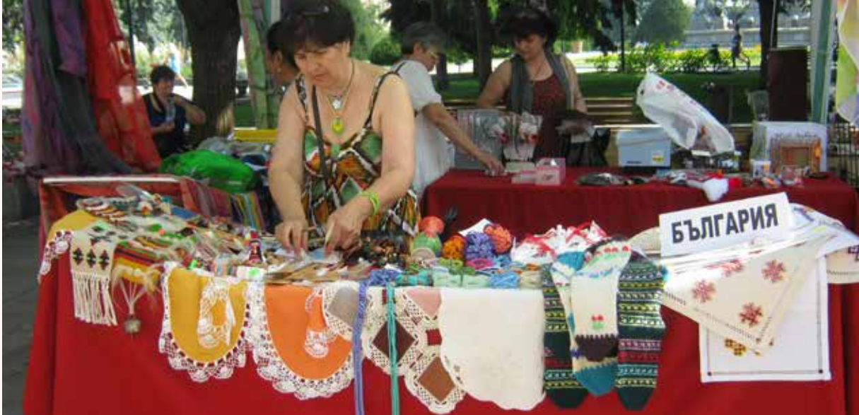
Second International Festival of Home-based Workers in Sofia, Bulgaria, 2013.