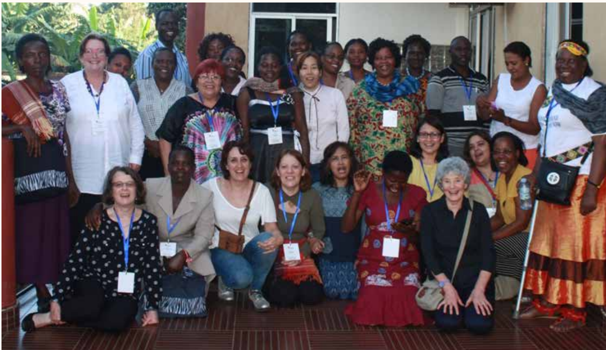
Home-based worker representatives meet in Uganda, 2015.