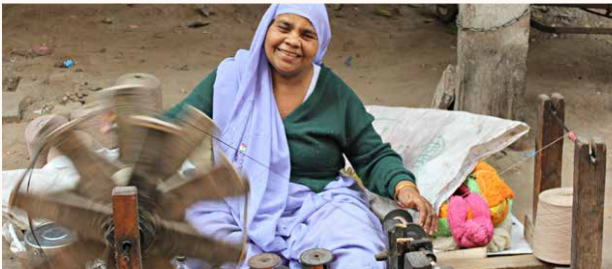
Image of a home-based worker taken during a field visit to Sunder Nagari in Delhi, India