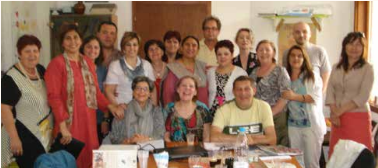
Organizers from Asia visit Bulgaria and meet with home-based workers from Eastern Europe in 2013.

The initial plan for the exchange visits was to have African and Eastern European countries visit India on exposure visits to learn from SEWA – a well-established trade union of women informal workers (including home-based workers). However, the program of activities was broadened to allow for HBWs from South Asian countries to learn from the situation of HBWs in Africa and East Europe. In May 2013, the exchanges began with a visit by three home-based worker organizers from India to Eastern Europe. There, South Asian participants conducted a needs assessment based on discussions with 21 representatives of HBW organizations from Macedonia, Turkey and Albania (with Bulgaria, Croatia and Bosnia acting as observers). The visit provided an opportunity for South Asian participants to learn about the Eastern European organizations, main issues faced by HBWs in the region, the legal framework governing home-based work, and to experience the realities of HBWs in the region through visits to the workplaces of HBWs. The topics of the meeting also served to inform the programme (through a needs assessment) for a future exposure visit by Eastern European participants to India.