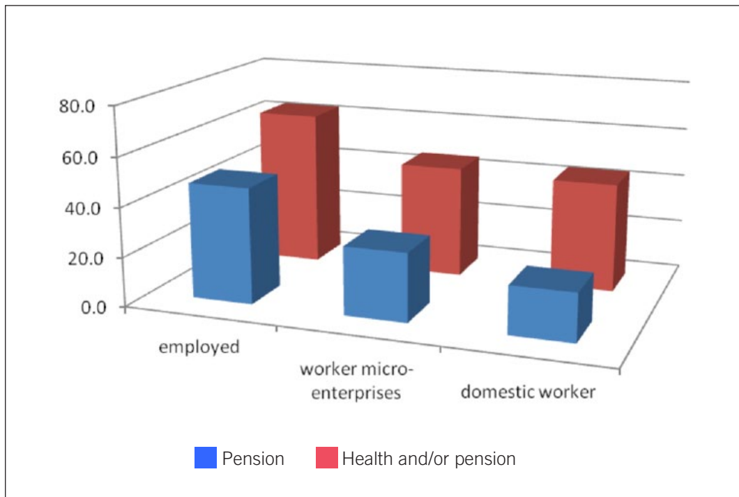
Graph 2: Access to Protection in Health and/or Pensions by Type of Employment Among Urban Workers

Coverage of domestic services varies according to countries and by type of risk covered, old age pensions or pensions, and/or health. As graph 2 shows, the latter is better covered. This is probably because health coverage is less expensive and its impact is more immediate than pensions that will be received after retirement.