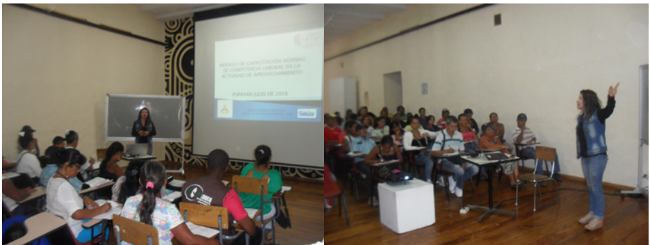
A member of WIEGO Colombia's technical support staff facilitating a capacity-building module on occupational skills in different cities.