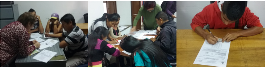
Waste pickers retaking the tests to proceed to the advanced level.