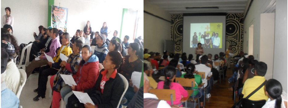
A SENA evaluator conducting an awareness-raising activity.