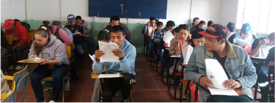
Application of questionnaires.