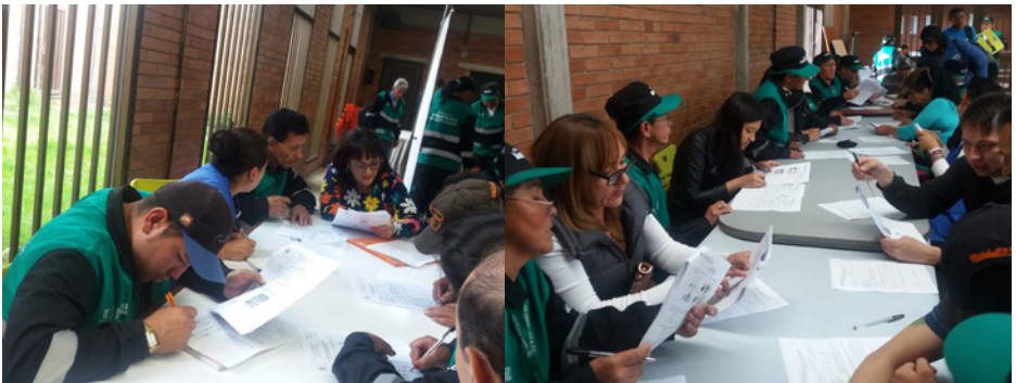
Bogotá, 2016

Waste pickers who have problems reading and writing, or illiteracy problems, have the right to ask for a tutor – a critical support because it ensures that the test will be the same for all, regardless of the conditions.