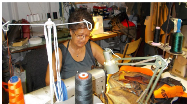
Machinist working out of a garage, Athlone Cape Town.

Home-based workers' organizations in South Africa tend to be fragile where they exist. Trade unions have not been successful in organizing their ex-members and many groups are supported by NGOs. The type of support differs for craft workers and garment workers. For the former, NGO support tends to be for social groups whose main existence may not be economic, but instead organize