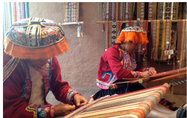
Home-based workers in Peru.

resources. Although these regulations do exist, Argentina remains the only country in Latin America to have ratified the ILO Convention 177. Peru and Uruguay both, however, have incorporated aspects of C177 into existing legislation.