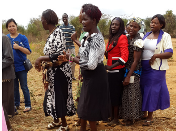
Visit to the Malembwa Women's Group in Kenya, 2014.

During the regional workshop in Nairobi (2014) the South African Self-Employed Women's Association (SASEWA) was identified as the focal organization in South Africa to lead the organizing and networking process amongst home-based workers. WIEGO facilitated a series of capacity-building workshops for leaders, as well as existing and newly-recruited members of SASEWA.