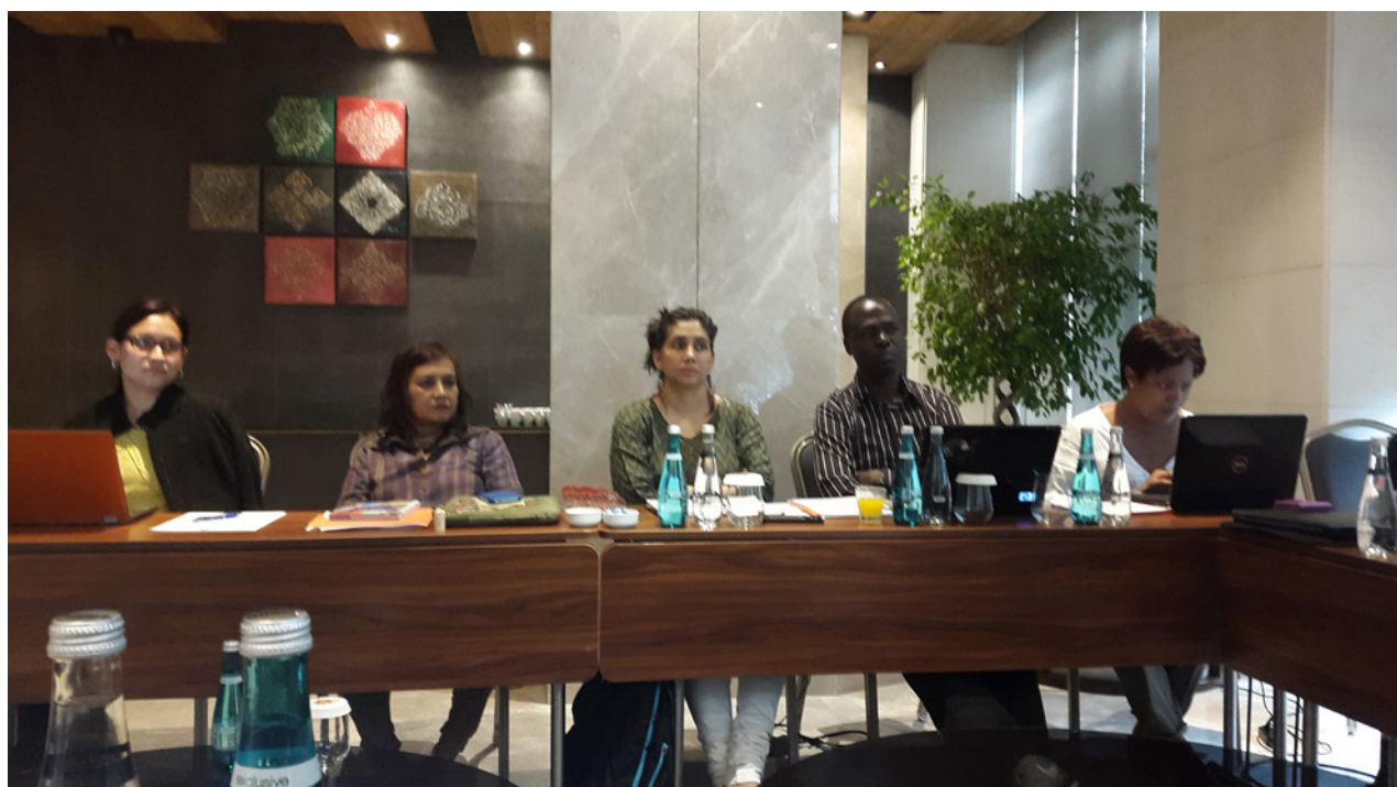
Coordinators from different regions plan for the future, Istanbul, 2015.

In September 2015 WIEGO convened a strategy meeting in Istanbul. This was a place for WIEGO and its partner organizations to come together and highlight the successes and challenges home-based workers face, and to develop plans for joint global work and joint work in each of the regions—Africa, Latin America, South and Southeast Asia, and Eastern Europe. Participants all committed to continue building the movement of home-based workers, even though resources are limited.