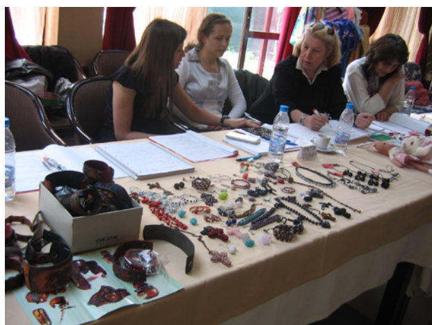
Innovative Workshop in Sofia, Bulgaria.

In 2015, WIEGO and HNEE jointly organized a training workshop in Sofia, Bulgaria. The focus was on strategic planning for the organization as well as market and product innovation for the separate country networks of Albania, Bulgaria, Georgia, and Kyrgyzstan. By the end of the five-day workshop, the hope was that members had an increased understanding of marketing methods and available markets—critically important for own-account home-based workers. This workshop was also central for developing