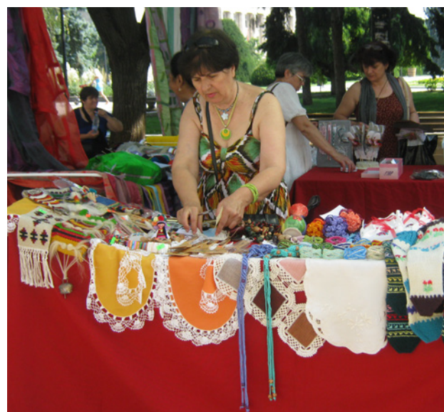
Second International Festival of Home-based Workers in Sofia, Bulgaria, 2013.

This is the newest HomeNet. At an International Conference in Sofia in March 2012, it was decided to create a Balkan network of home-based workers by signing a Universal Declaration. Representatives