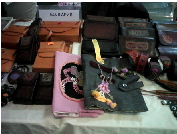
The Festival in Bishkek, Kyrgyzstan.

of Kyrgyzstan wanted to combine their own Conference with that of HNEE. They wanted to learn from the other countries and to show policy makers in Kyrgyzstan about good practices in Eastern Europe with regard to organizing, law, and practice.