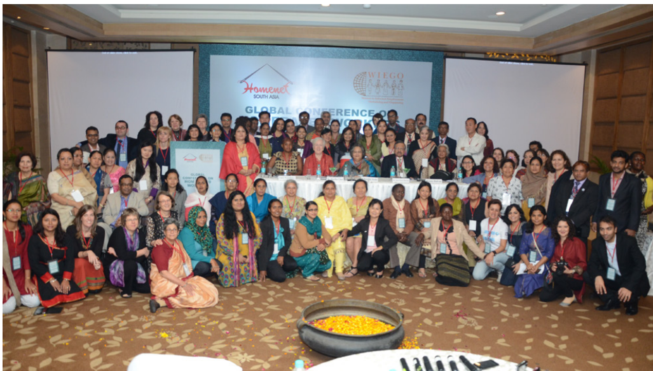
Participants at the Global Conference on home-based workers, 2015.

More than 100 home-based worker representatives and supporters from 24 countries took part in a historic Global Conference on Home-based Workers, organized by HomeNet South Asia (HNSA) and WIEGO in New Delhi, India in February 2015. The results of the meeting were the Delhi Declaration, the first global declaration for home-based workers, and a five-year global Action Plan.