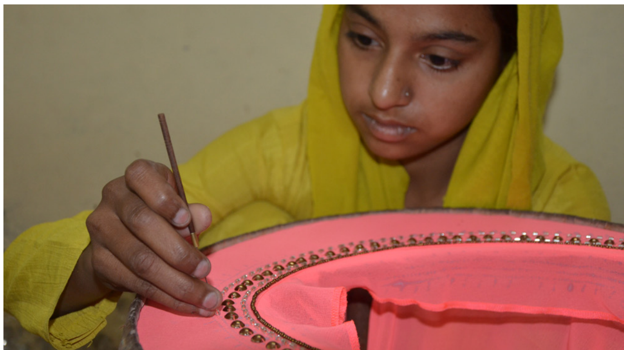
A home-based bead worker in India.