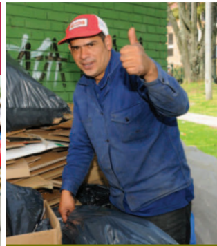
data from the study are cited constantly