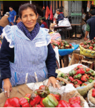
organization has renewed contact with its members