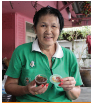
held two city dialogues on public bus service