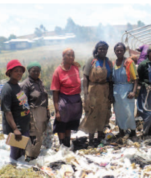
dialogue meetings were held with county authorities