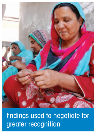
findings used to negotiate for greater recognition