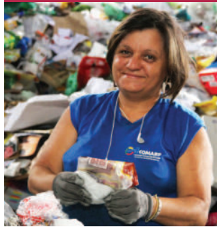
held a policy dialogue with local administration as part of Zero Waste Week