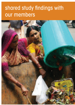
shared study findings with our members