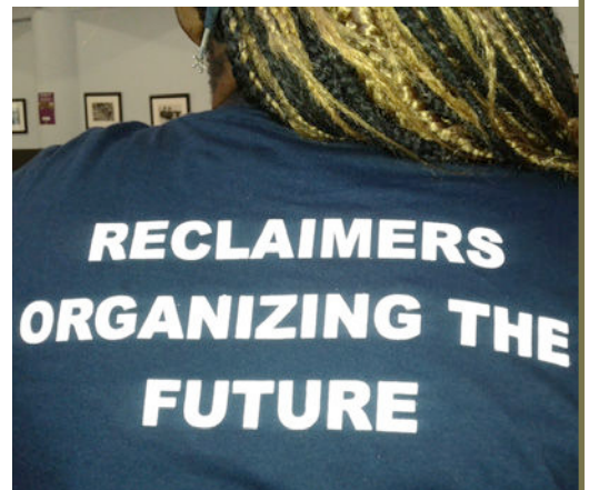
A participant shows off the back of her t-shirt during one of the organizing events.

Waste Integration in South Africa (WISA) is a three-year (2016-2019) organizing project funded by the Commonwealth Foundation to support organizing efforts among waste pickers in the cities of Johannesburg, Tshwane and Sasolburg in South Africa. The project coincides with a national-policy development process of the Department of Environmental Affairs involving the development of guidelines for municipal authorities to follow as they integrate waste pickers into local solid waste management systems. (Continued on page 2).