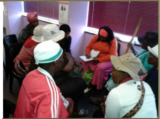
George Goch women reclaimers.

A first step was to consult with the SAWPA national committee — which includes all nine provincial representatives of SAWPA from all three project cities — to introduce the WISA project. Then, in Johannesburg, a historic mass meeting between two types of reclaimers — those working on landfill sites and those working on the streets — was organized by WIEGO on December 3, 2016. This was the first time that reclaimers from both groups met to talk about their work and share experiences. The 105 reclaimers who gathered at the meeting elected representatives from the 7 work sites to form the Johannesburg representatives' committee. The WISA project was also introduced to the Tshwane reclaimers committee, which represents four areas of reclaimers, mainly those working on landfill sites. The Tshwane Rankuwa, Onderstepoort, Mamelodi and Soshanguve (ROMS) Committee must still reach out to organize reclaimers working on