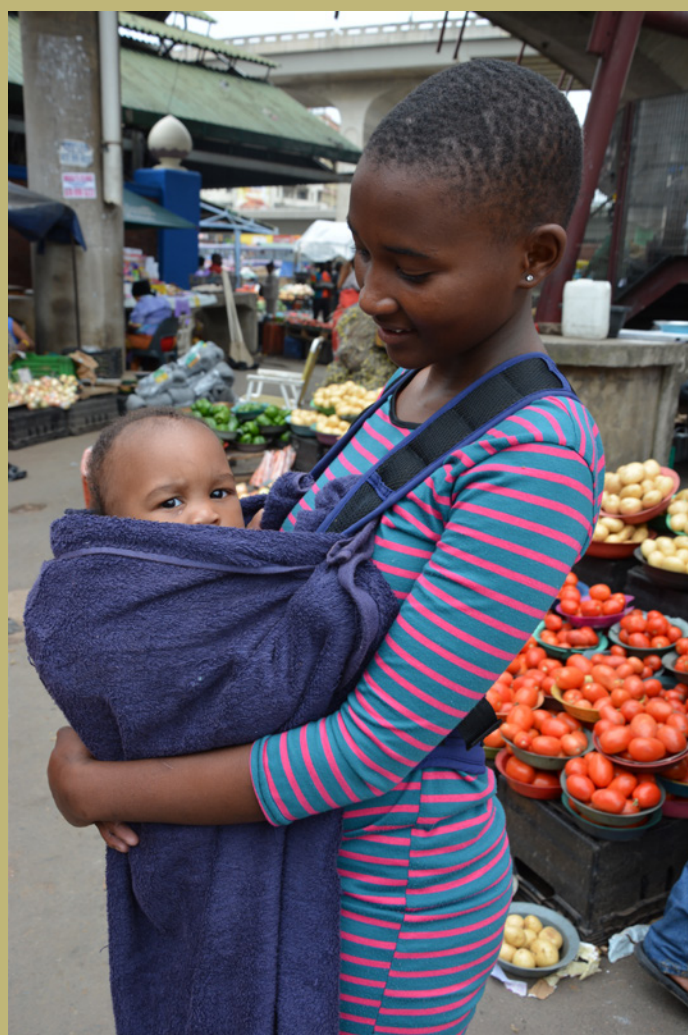
WIEGO undertook exploratory research in Accra, Ghana and Durban, South Africa on child care and women's economic empowerment.