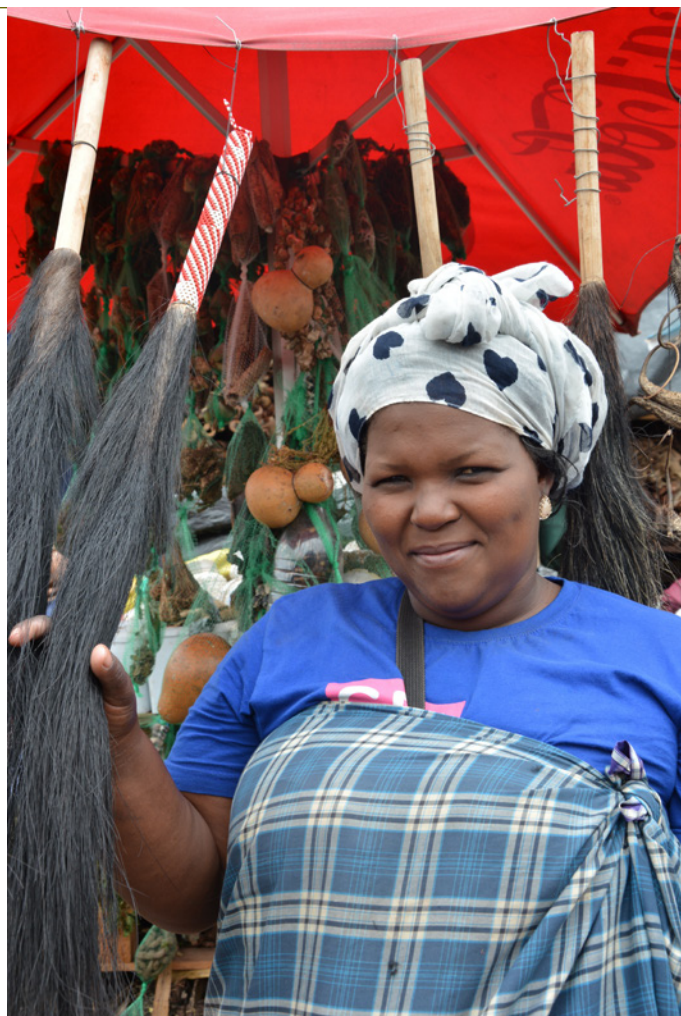
Street vendors in Durban, South Africa have won legal victories with the help of WIEGO.

were removed and legislation was proposed—the Business Licensing Bill—that would have criminalized many informal sector jobs if it had become law. A particular focus for WIEGO was generating information to support membership-based organizations and their allies, including lawyers.