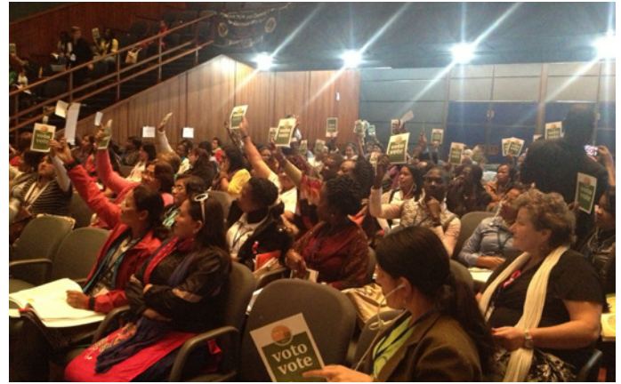
The International Domestic Workers Network became the International Domestic Workers Federation (IDWF) in Montevideo, Uruguay in 2013.

WIEGO implemented, in concert with the IDWF and the global trade union IUF, a project called Economic and Employment Rights: Advancing Domestic Workers'