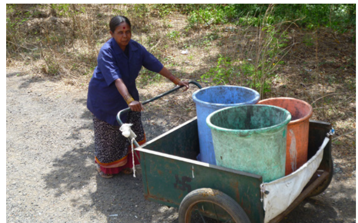
A waste picker with SWaCH, a cooperative of waste pickers' in Pune, India. SWaCH has negotiated a contract with the municipality allowing door-to-door collection of segregated waste. This has considerably improved the waste pickers' working conditions and livelihoods, while providing economic and environmental benefits to the city.

WIEGO has been supporting the development of the Alliance of Indian Wastepickers (AIW) in the areas of research, leadership training, fundraising and occupational health.