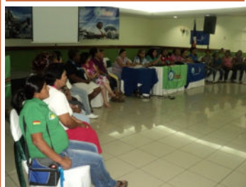
Women waste pickers taking control of the assembly to discuss gender issues