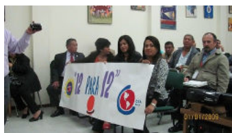
"12 by 12" Campaign in Colombia