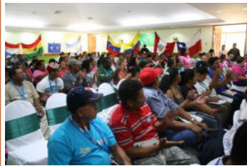
Waste Pickers Conference