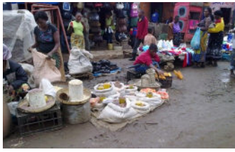
Street Vendors in Zambia