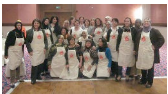
Meeting with the Arab Women's Network supporting the ITUC "12 by 12" Campaign