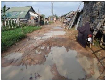
Teak Sin Khang Thbong village slum area in the rainy season