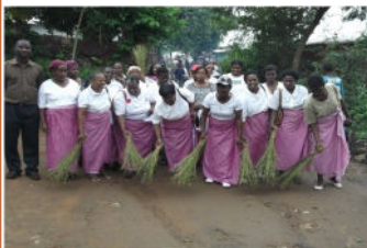
Women of MUFIS celebrating International Women's Day by sweeping Manase Market in protest of the city's neglect