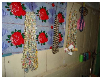
Jewelry (above) and handbags (below) produced by the Angkor Khmer Silk Women Light Handicraft Association