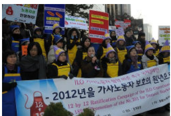
"12 by 12" Campaign in South Korea