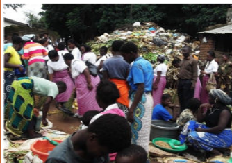
MUFIS women cleaning Manase Market