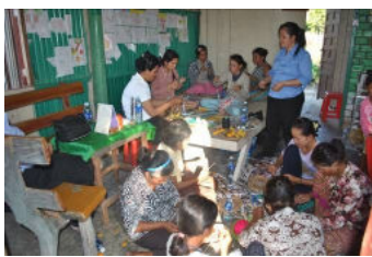
Association members in a product development training