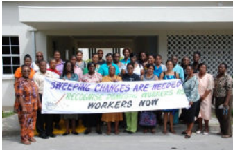
Caribbean Domestic Workers Network (CDWN) launch, See p 3 for more information