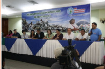
Head table of panelists included leaders of waste pickers, environ- mental minister and supporters