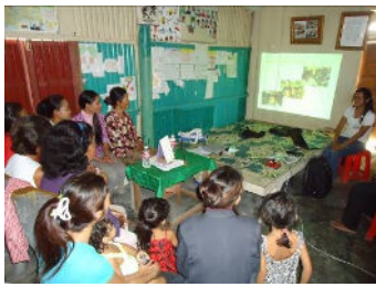
Association members and their children in a leadership training