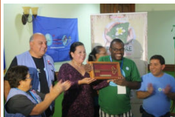
RedLacre receiving the "Key of Managua" from the Mayor