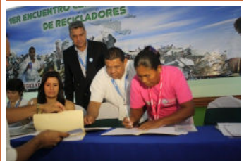
Waste pickers signing first MOU with the Municipality