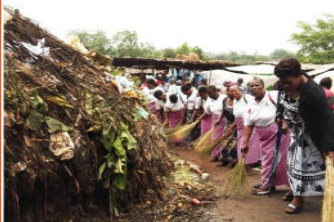
Sweeping MUFIS women approaching the pile of refuse in the Market