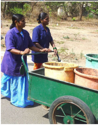
Photo taken during solid waste management (SWM) system tour in Pune as part of the Global Strategic Workshop in Pune, India