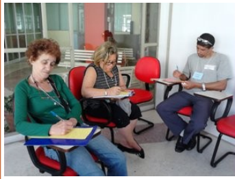
Street vendors from the centre of Rio (above) and Porto Alegre (below) draft letters of demand