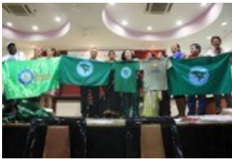
Photos from Day Two of the Global Strategic Workshop in Pune, India (above and below)