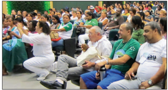
Feedback meeting about phase one of the project at the Waste and Citizenship Festival, 2012.