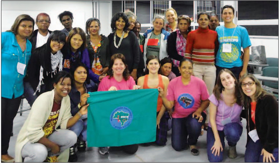
Group photo of women participants in the workshop for the metropolitan region of Belo Horizonte

Participatory methods are essential in exploring the many levels of submission and discrimination women waste pickers face and in creating resources for their empowerment and opportunities for their economic autonomy.