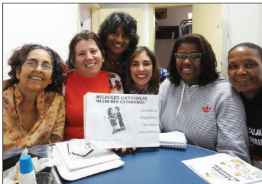
Drafting the popular gender toolkit.

“What we need is to be in a collective discussing autonomy, when things are done as a group we are able to advance our autonomy...”