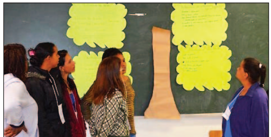
Autonomy tree exercise – different dimensions of gender empowerment are discussed.