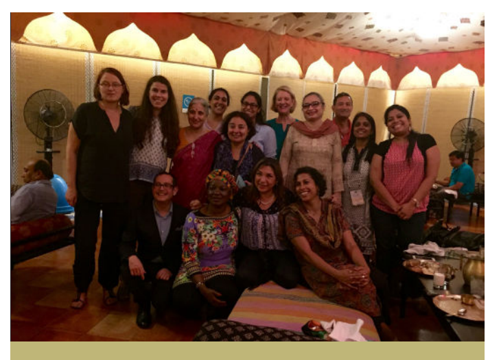
HLP Consultation participants before first day of activities

From the HLP's initial meeting, informal work and collective voice were identified as key areas of focus. As the HLP process progressed, panelists adopted a commitment to the principle of "nothing for us without us," putting women's participation and voice at the center of all actions. The consultation, "Women's Voices from the Informal Economy" reflects these focus areas and commitments, and was designed to give HLP members the opportunity to hear directly from women informal workers themselves about how they define, experience and struggle for economic empowerment.