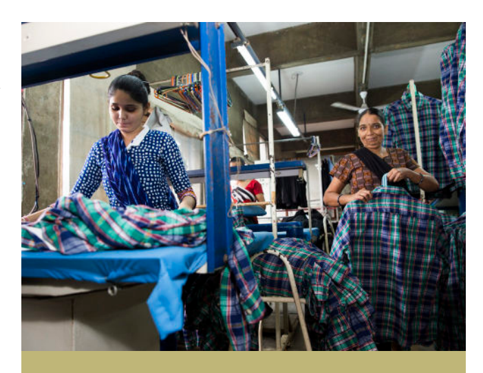
Finishing garments at SEWA Trade Facilitation Center