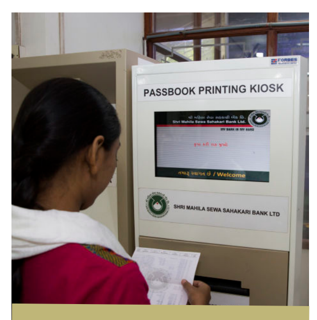
Using digital passbook printing kiosk at SEWA Bank