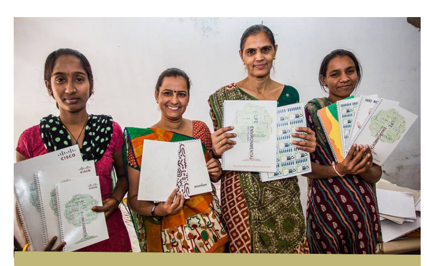
Members of SEWA Gitanjali Cooperative displaying their products

The main objectives of the Gitanjali cooperative are to provide women waste recyclers a decent livelihood, a sense of dignity to their work and life, occupational safety, and income security. The Gitanjali Waste Pickers Cooperative was organized in response to challenges waste pickers were facing in the wake of the global recession – prices for scrap materials drastically reduced and waste management services in Ahmedabad were privatized. The cooperative was formed in 2010, focused on producing stationary products from 100% recycled waste paper. Today the cooperative provides a sustainable livelihood and income to more than 200 members, including the daughters or many of the original waste pickers. Through the cooperative, members have been trained in the creation and marketing of stationary products. With support from WeConnect International, Gitanjali cooperative connected with Accenture, one of WEConnect's founding corporate members. Since the start of the program, the SEWA Gitanjali cooperative has increased earnings tenfold, and has become one of Accenture's principal suppliers for stationary products.