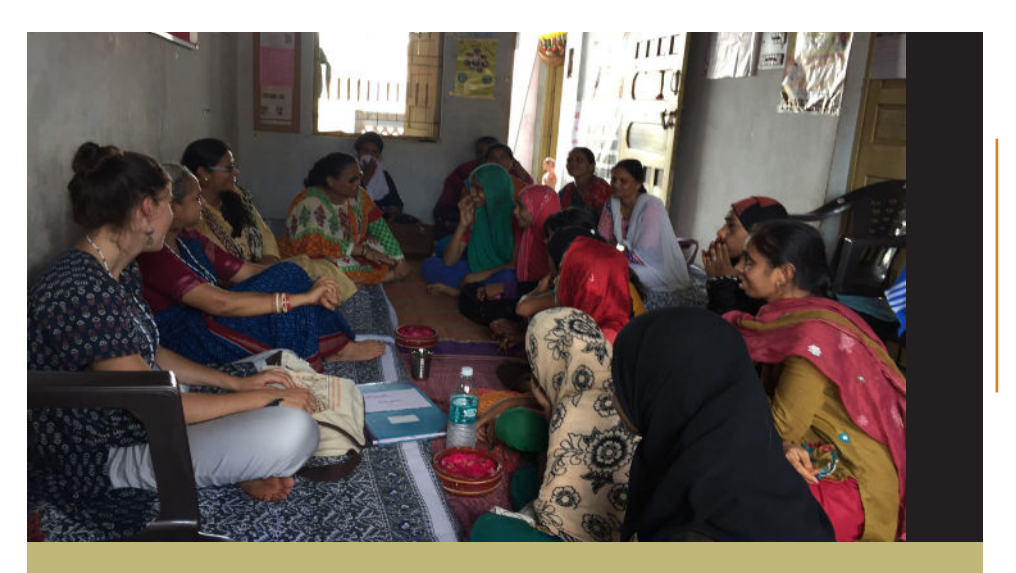
SEWA Youth Group meets at SEWA Shakti Empowerment Centre

The SEWA Shakti Empowerment Center is a new initiative created in the neighborhood of Danilimda for women to be able gain access to information about and assistance applying to government schemes. The center also hosts a youth group of young girls from the neighborhood, who meet to receive talks from organizers about a range of different topics including health and well-being.