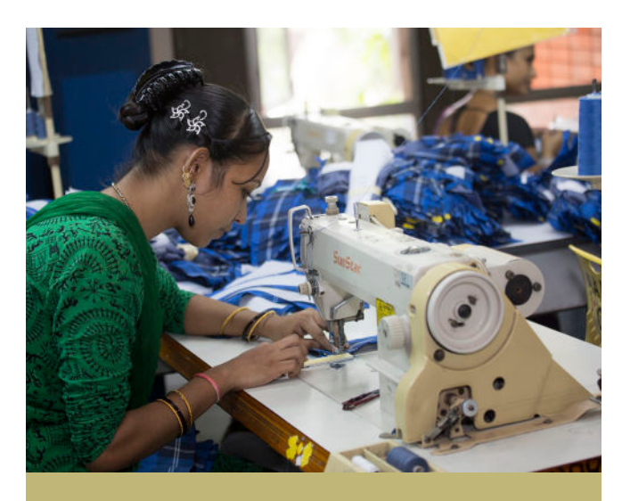
Stitching work at SEWA Trade Facilitation Center