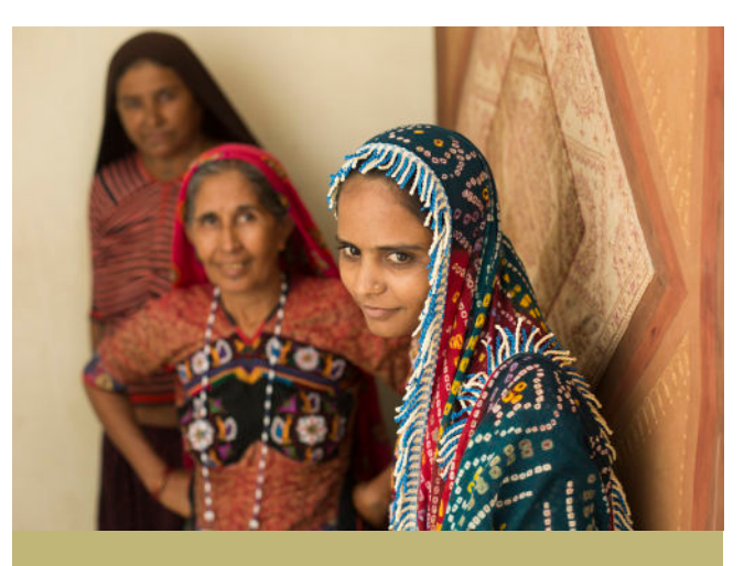
Artisan shareholders at SEWA Trade Facilitation Center