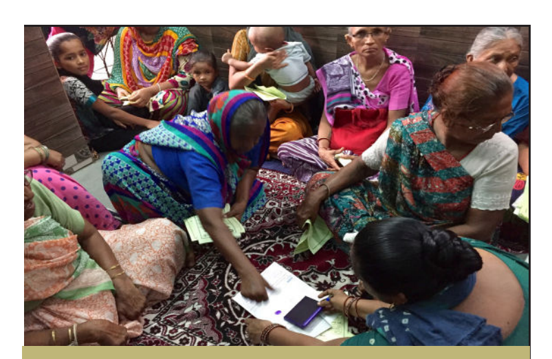
Members of Vimo SEWA (Insurance Cooperative) signing for their insurance premium payments

The visit ended with a stop by a meeting of VimoSEWA Insurance Cooperative members. Several women were collecting premiums after having missed work and lost earnings due to illness. The cooperative offers micro-insurance to its members, and its products are designed especially with the needs of informal workers in mind. It is a financially self-sustaining cooperative. Of the effect of Vimo SEWA on her life, one SEWA member explained, "Earlier I had to borrow from my neighbors or the moneylender if my children got sick. After I took Vimo SEWA Cooperative's insurance policy I felt at ease. Now I am a Vimo