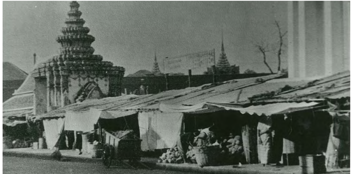
Figure 2: Archival photo from 1954 (B.E. 2497) depicting some early Chinese immigrant street vendors