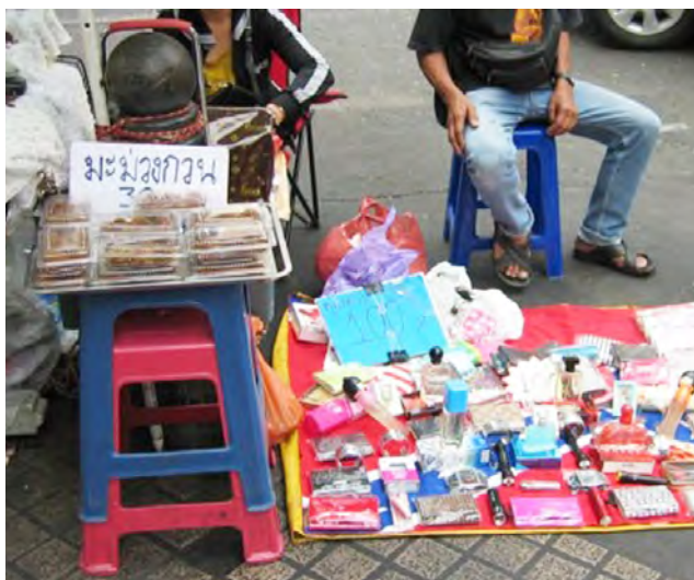
Figure 6: Illegal vending is characterized by designs that are easily and quickly packed and put away. This type of street vending is called bair ga din in Thai. Bair means “to spread,” ga is the colloquial form for “and”, and din means “ground”.

There have been both positive and negative developments associated with attempts to “balance” the policies regarding the environment of the city and poverty alleviation. On the positive side, cleaning fees were reduced from 150 to 100 baht per square metre.