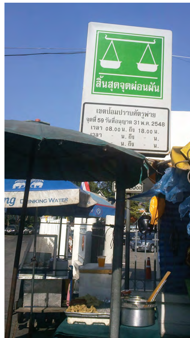
Figure 5: A sign indicating a public space designated for street vending, as ratified by The Act on Maintaining Public Cleanliness and Public Order B.E. 2535 (1992) authorized the BMA, with the approval of the Traffic Police Division.

At the national level, in the 7th National Economic and Social Development Plan (1992-1996), petty traders were listed as one of the six groups of poorest people that the government singled out for special attention. However, research indicated that despite the government’s efforts to encourage the improvement of livelihoods of the less privileged through petty enterprise, its programs and initiatives were inaccessible to many people due to difficulty for applicants to meet the criteria. The 8th National