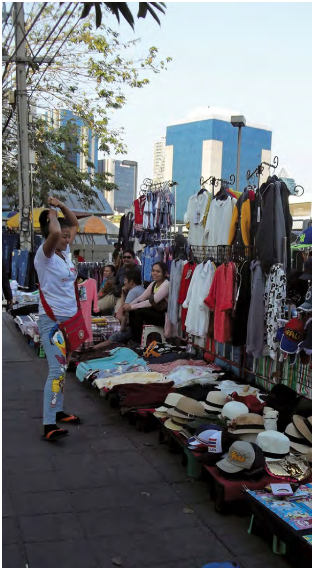
Vendors in Bangkok sell goods produced in Thailand as well as the rest of the world, including and especially China. Hence, they are part of global supply chains.