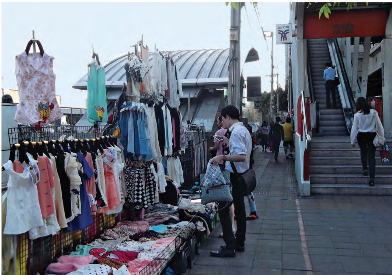
Figure 3: Access to public space has also been a source of conflict both historically and recently, with high land-value areas being “hotspots” for controversy. Ratanawaraha (2014) has indicated diurnal differences in how these high land-value areas are used – they can be more or less sought after in the evening depending on the location. Indeed, skytrain stations are particularly strategic locations for vending.

In their case study of Soi Convent – a small street known for the quality and variety of its food – Sareena Sernsukskul and Pattama Suksakulchai point to the nimbleness of various types of street vendors and their adaptation to the changing urban environment: