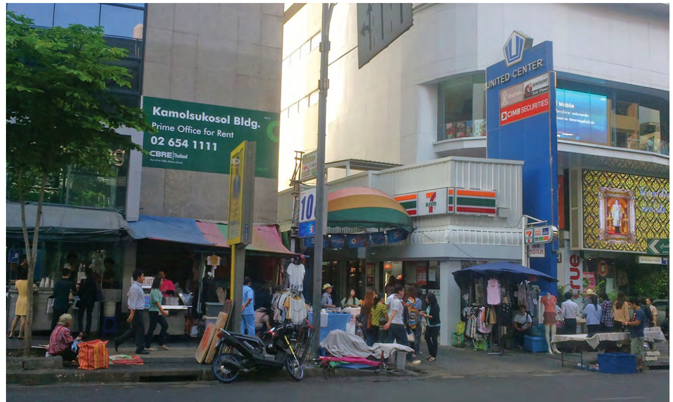
Figure 7: Here, a photo of Silom road which illustrates the contrast between a modern cityscape and traditional streetvending coexisting side by side.

services. However, as the preceding illustration of historical and policy development has shown, these gains have been hard won and have involved negotiating with local authorities, disconnects between policy and implementation, and competing views on the function and value-added of street vending in a growing yet fragile urban context. The exact role that vendors themselves have played overall in developing this policy – as opposed the local and national policymakers – is unclear and may require further research. Evidence in this brief points to the key role that the BMA Governor