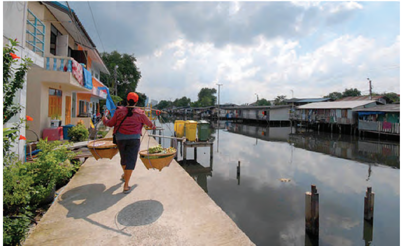
Figure 4: an itinerant vendor (known in Thai as hab rae ) at the Bang Bua Canal community. Generally speaking, mobile vendors are poorer than those operating from a fixed pitch.

The city of Bangkok has become more lenient, accommodating and sometimes even supportive of vending over the years, recognizing its importance for the culture and economy of the city and the livelihood of its millions of urbanites. Policies concerning street vending in Bangkok have pertained to the environment of the city, hygiene and poverty reduction.