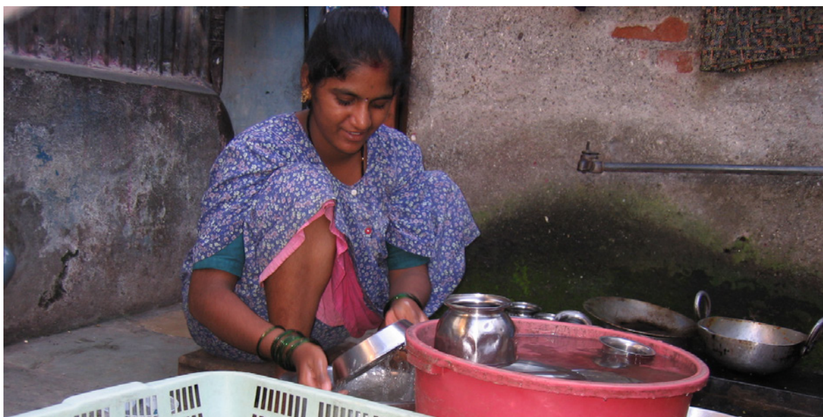
Domestic workers in Delhi are not registered under the social security authority. This has resulted in their exclusion from emergency cash grants, which have been extended to registered groups of unorganized sector workers, such as construction workers.