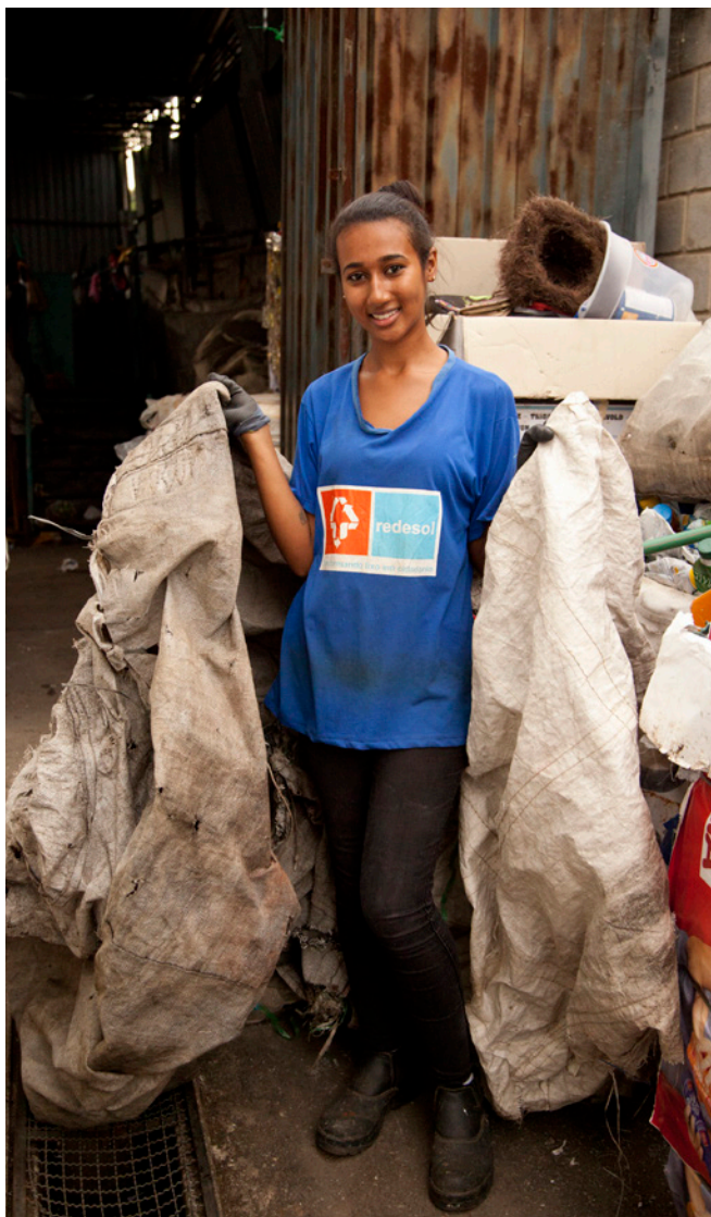
This Brazilian catadora belongs to the second level cooperative network Redesol in the state of Minas Gerais.