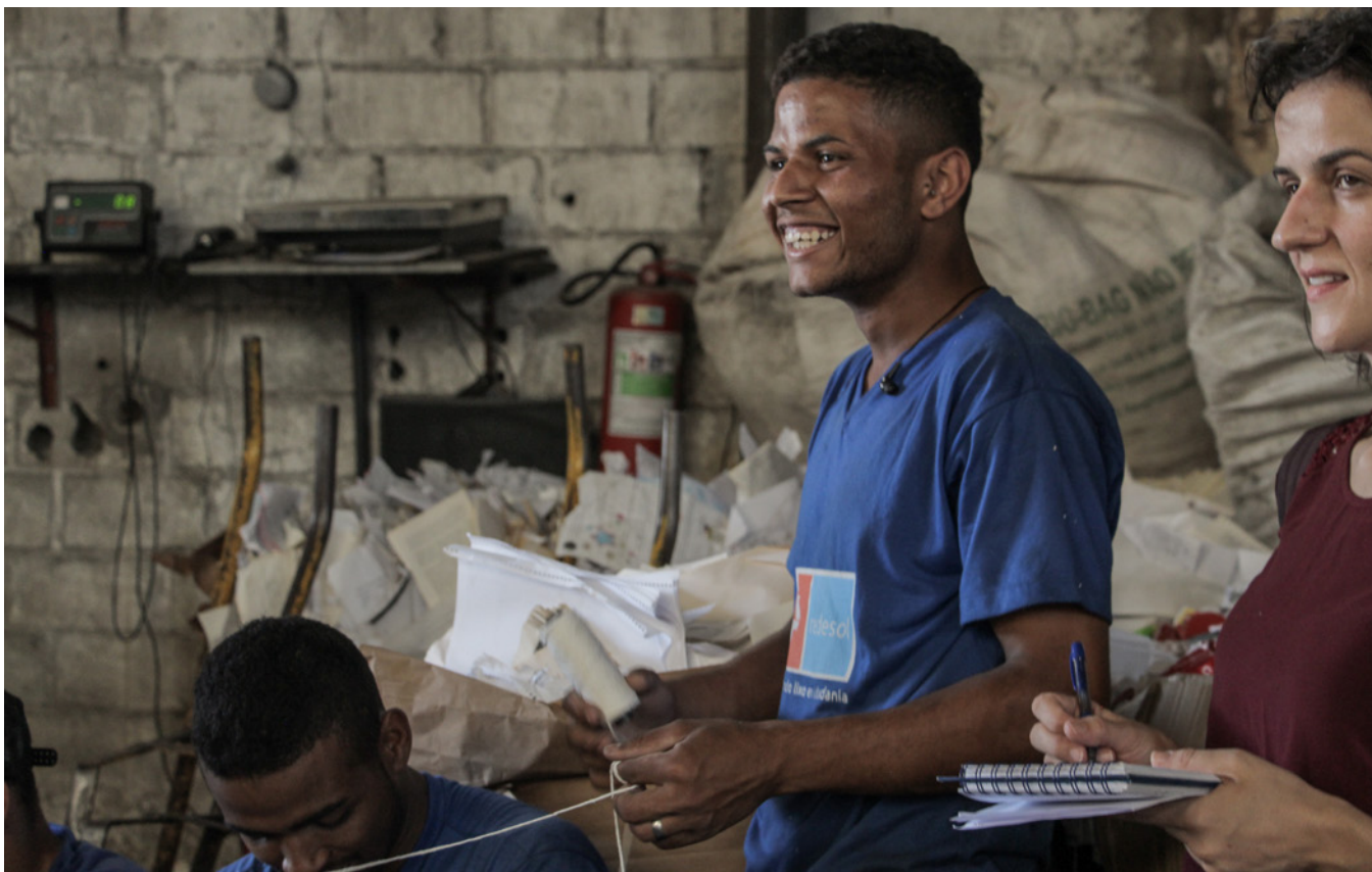
A Brazilian waste picker takes part in a Cuidar Health Risk project activity.