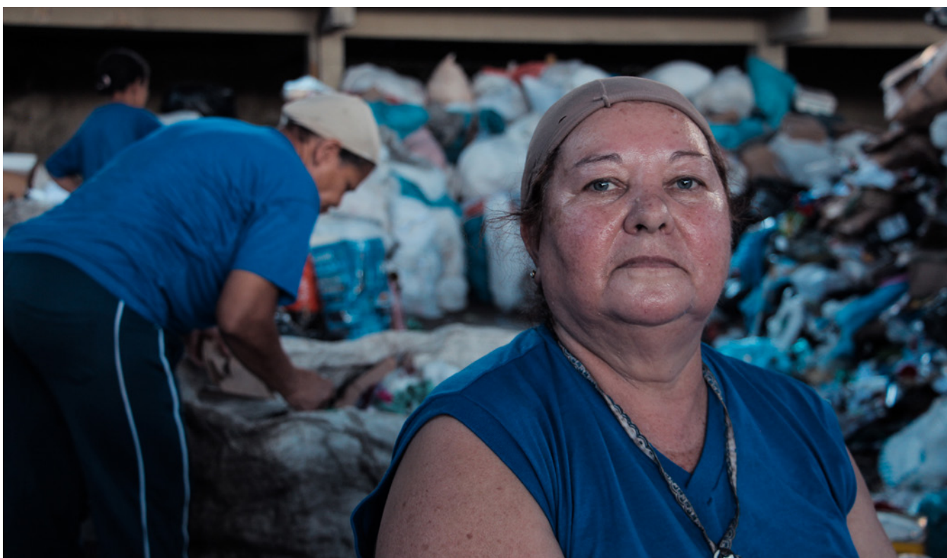
Waste pickers who participated in a targeted health project called the Cuidar Project in Belo Horizonte, Brazil.