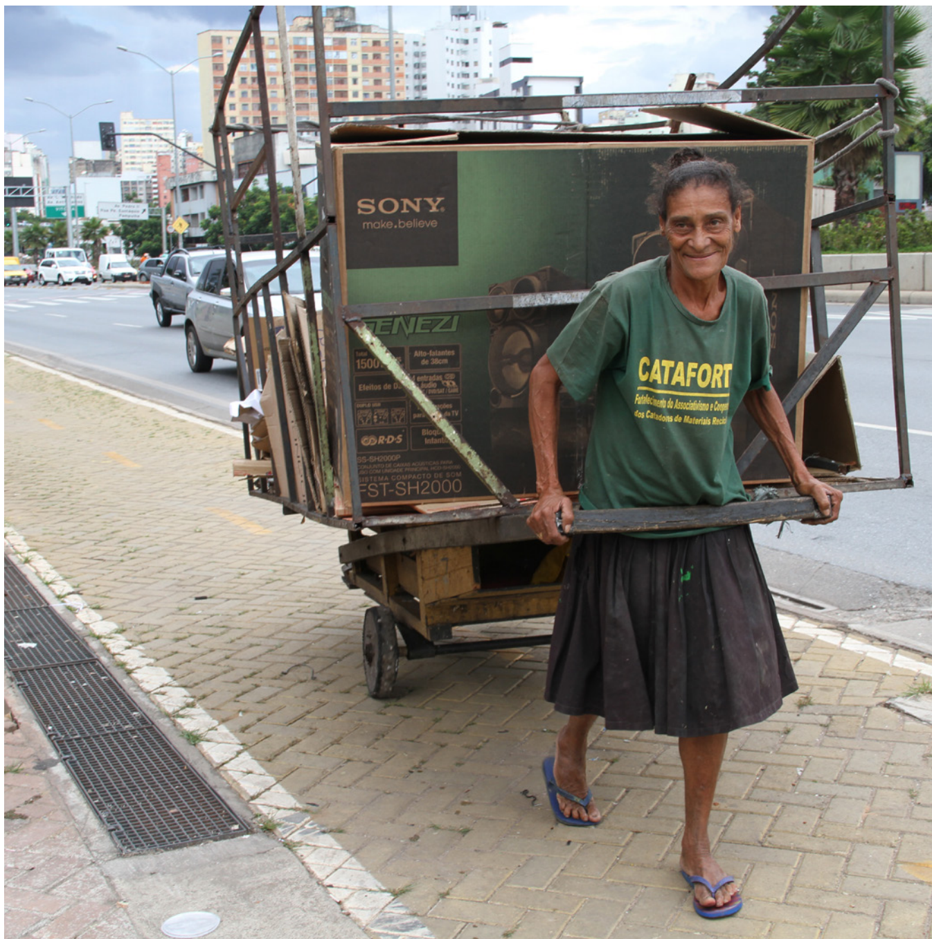
A catadora pulls a cart to collect what others have thrown away.