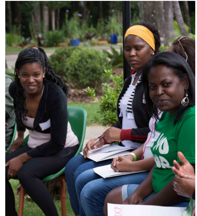
Women waste pickers in Brazil took part in a programme examining gender and waste.

country. Brazil recycles 97 per cent of cans and 67 per cent of cardboard. 5 Given that only a quarter of all municipalities have segregation at source collection systems, the high recycling rates are due to the work of the catadores . 6