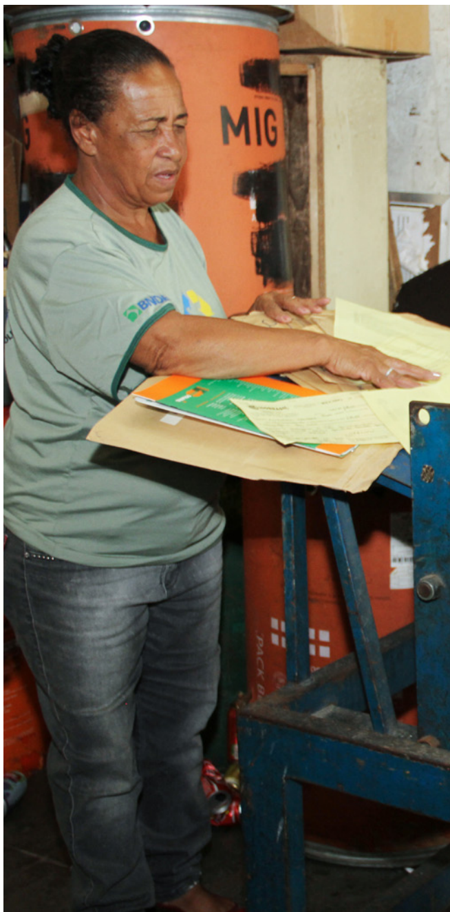
A catadora shreds waste paper for resale in Belo Horizonte.