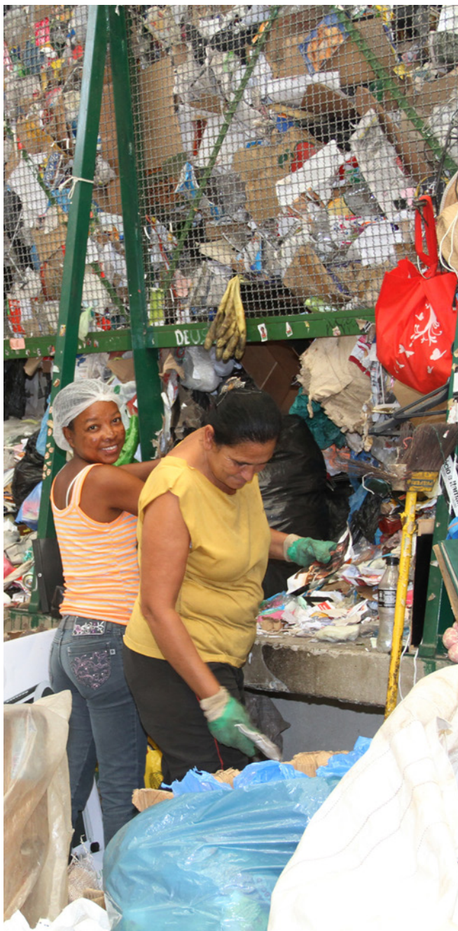
In Belo Horizonte, women workers segregate materials at their sorting centre.