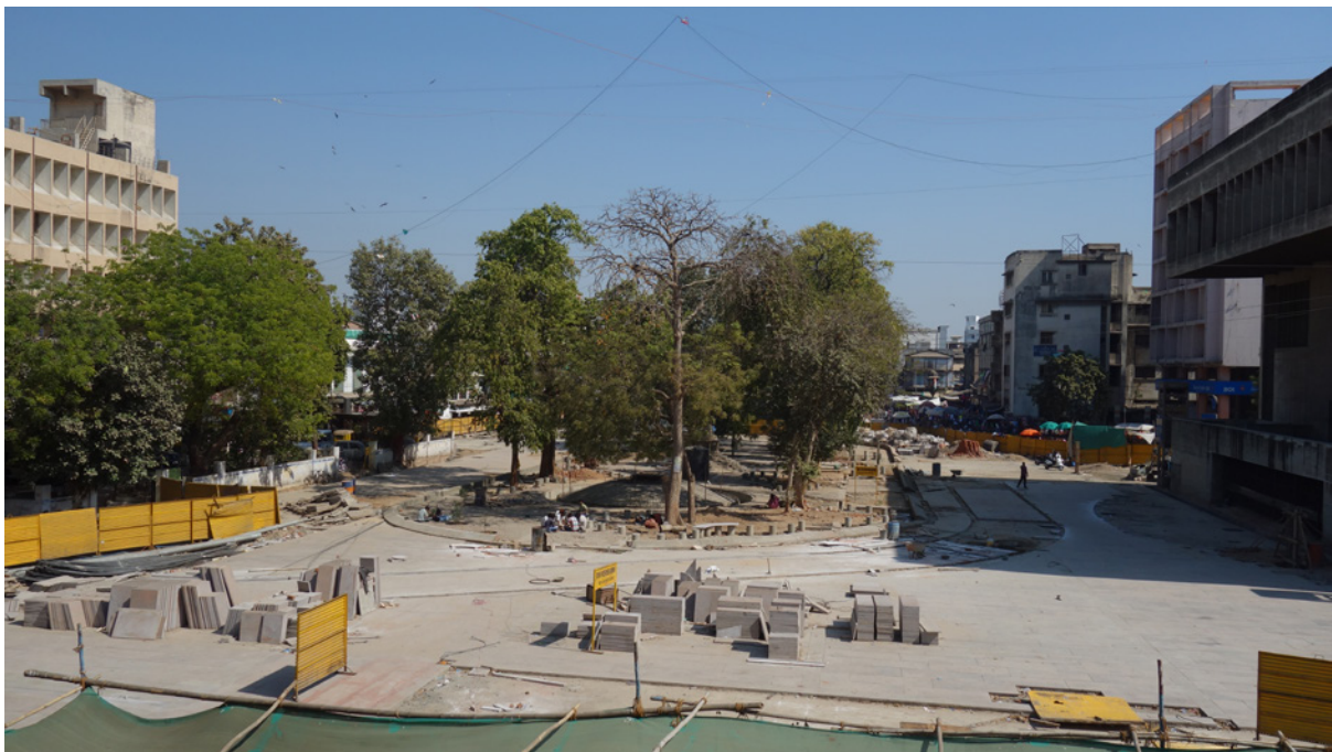
Cordoned-off area for plaza development, 2013.