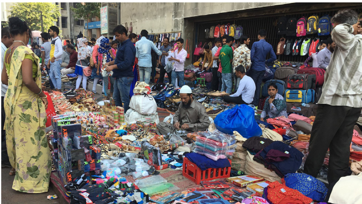
Market vendors, 2019.