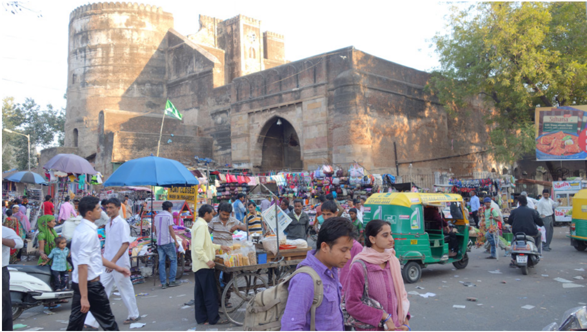
Bhadra Fort and market, 2013.