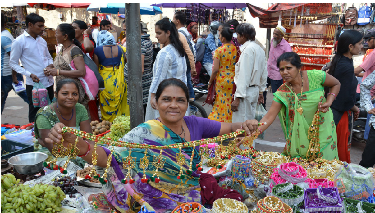
Market vendors in February 2020.

But the vendor leaders, as well as SEWA, are conscious of the heavy mantle of responsibility that is being placed on their shoulders: to maintain the solidarity and trust of the association members against significant opposition. As Ela Bhatt later confirmed, the Bhadra Chowk Natural Heritage Market Association of vendors will have to be able