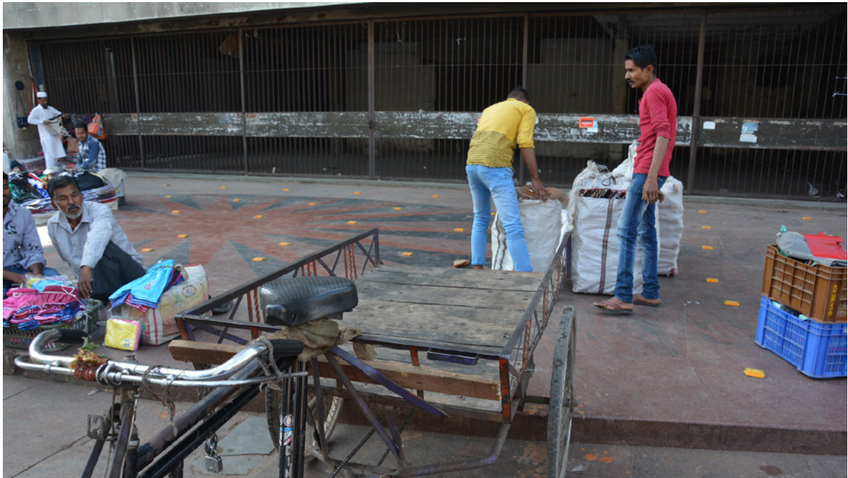
Vendors arrange their goods in spaces demarcated by yellow paint at the Bhadra Chowk Heritage Natural Market in February 2020.

celebration in the Bhadra Plaza area in 2015. Since then, they have been invited to dance and awarded a prize at every annual Navratri celebration.