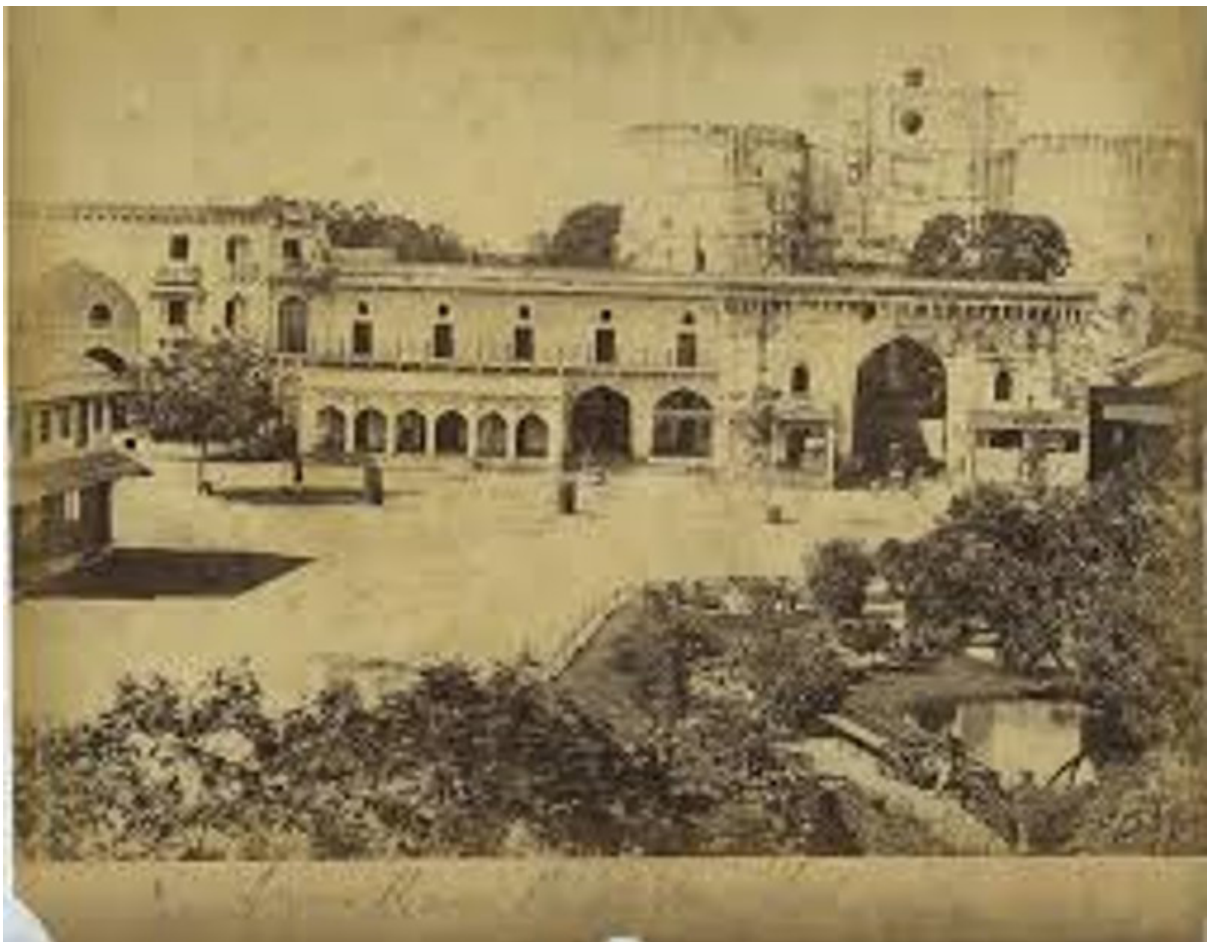
Historic photograph of Bhadra Fort and Maidan-e-Shah.

In 1411, Sultan Ahmad Shah I, the founder of Ahmedabad City in Western India, built his fortified palace, the Bhadra Fort, between the Sabarmati River and the walled city, leaving a large public space, called the Maidan-Shah, between the Bhadra Fort and Trun Darwaza, a triple-arch gateway to the walled city. As Johan Mandelslo, the Duke of Holstein, described in 1638, the Maidan-Shah was planned and landscaped by Ahmad Shah I to serve as a public space for ceremonial events, festivals and an open-air bazaar for royalty held every Friday (a religious holiday for Muslims). Beyond the Trun Darwaza was Manek Chowk – a market place for commoners and the commercial heart of the walled city. Under the Marathas and British, who ruled Ahmedabad after the defeat of the Moghuls in 1757, the Bhadra Chowk area declined in importance as a centre for pomp and ceremony. But weekly markets (called haats ) continued to operate in the area.