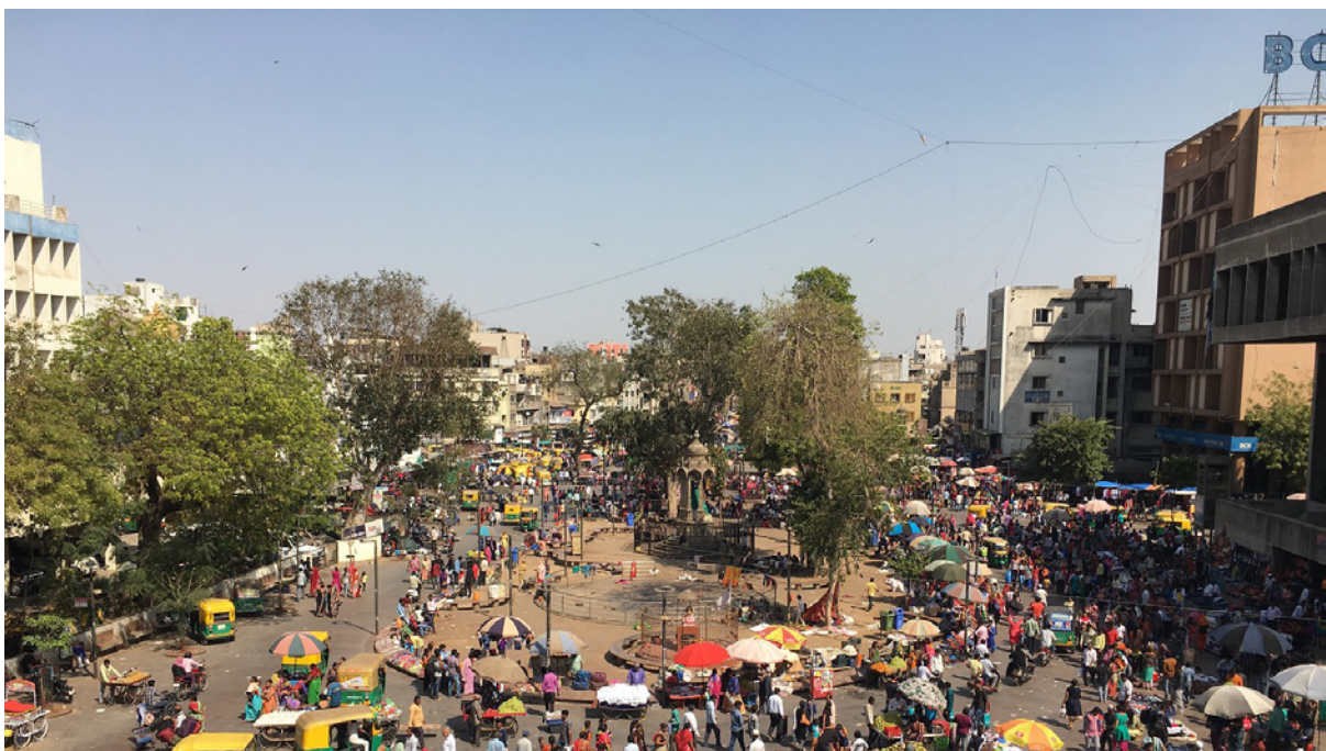
Bhadra Chowk Heritage Natural Market, 2019.

After many years of struggle and negotiation, SEWA was able to relocate 372 vendors within the Bhadra Plaza project area and another 131 outside the project gates, along the main road. All of the relocated vendors have two ID cards to verify their right to vend in their allocated space: one issued by the AMC, and another issued by SEWA, which includes the number of their allocated space. The market committee members patrol the area on a regular basis to be sure all the vendors in the plaza are genuine – have the two identity cards. It is clearly the case, as AMC officials attested, that no vendors would have been allocated space within the Bhadra Chowk without the intervention of SEWA. But the tensions between the municipal corporation, the police and the vendors persist.