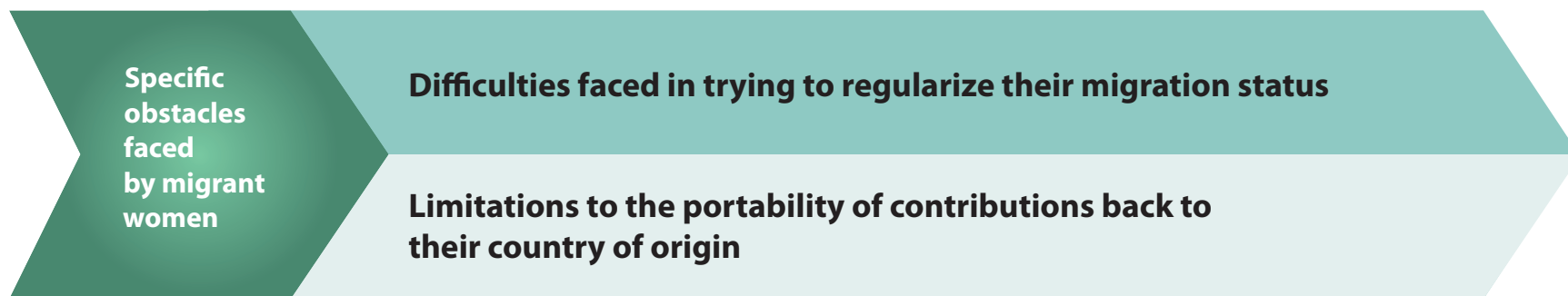
Figure 3. Obstacles Faced by Migrant Domestic Workers