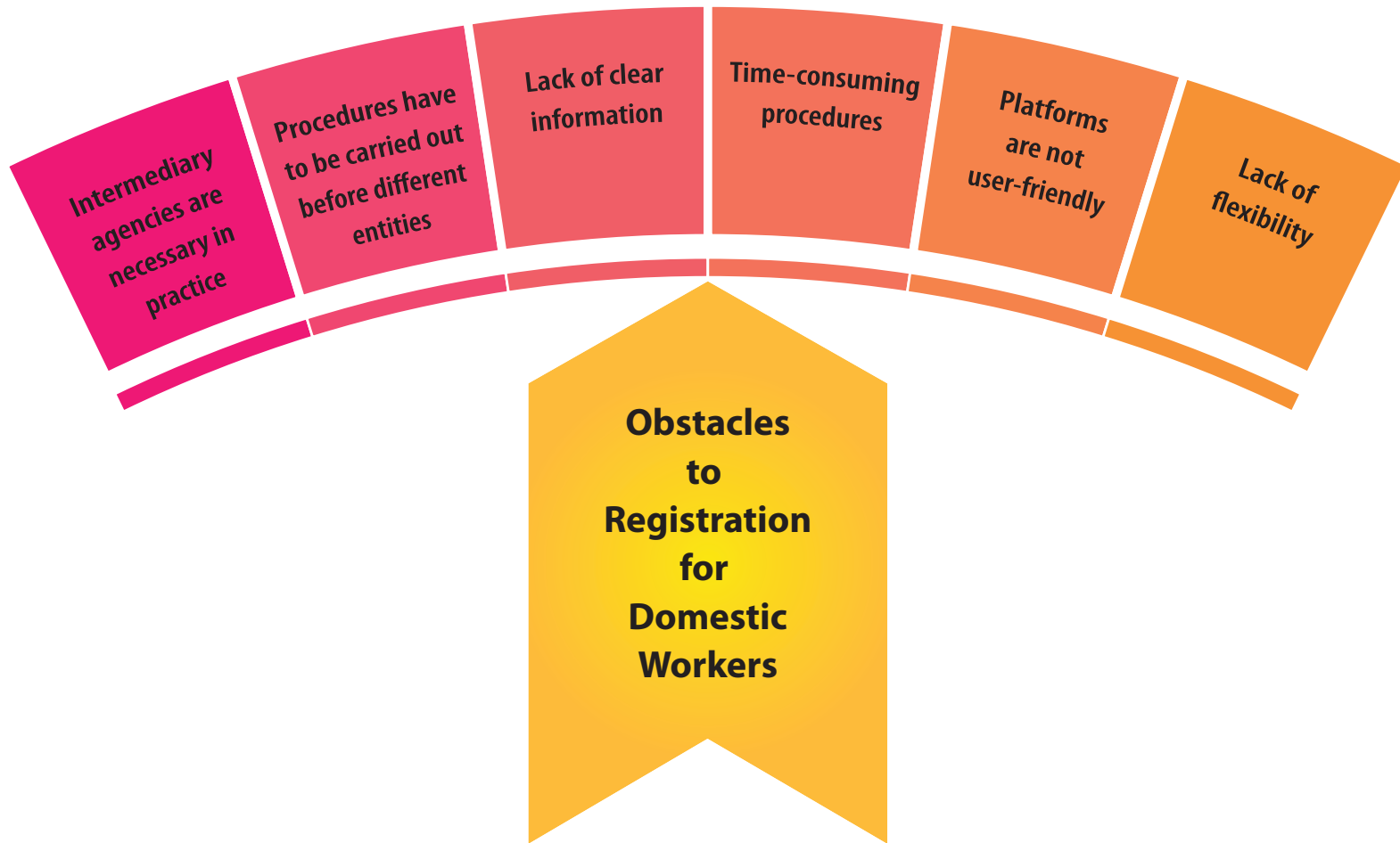
Figure 1. Procedural Obstacles to Registration