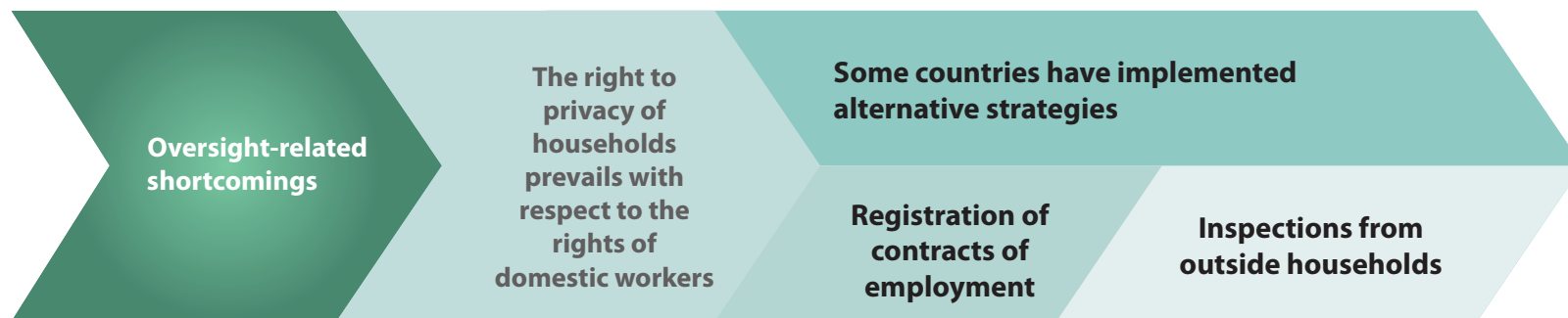
Figure 2. Oversight-related Shortcomings and Strategies

When robust oversight mechanisms are lacking, other indirect strategies may also contribute to turning the spotlight on the working conditions of domestic workers. One of these strategies is establishing the mandatory registration of contracts of employment or work relationships. This measure also puts employers under the obligation to recognize the work relationship before an agency. Furthermore, it raises awareness among employers on the obligations arising from hiring domestic workers. It also allows oversight agencies to control whether the working conditions agreed upon under the contract are in keeping with the law and provides the necessary information to follow up on the work relationship. This registration is required in countries such as Argentina, Bolivia, Brazil, Chile, Ecuador, Peru and the Dominican Republic (ILO 2021).