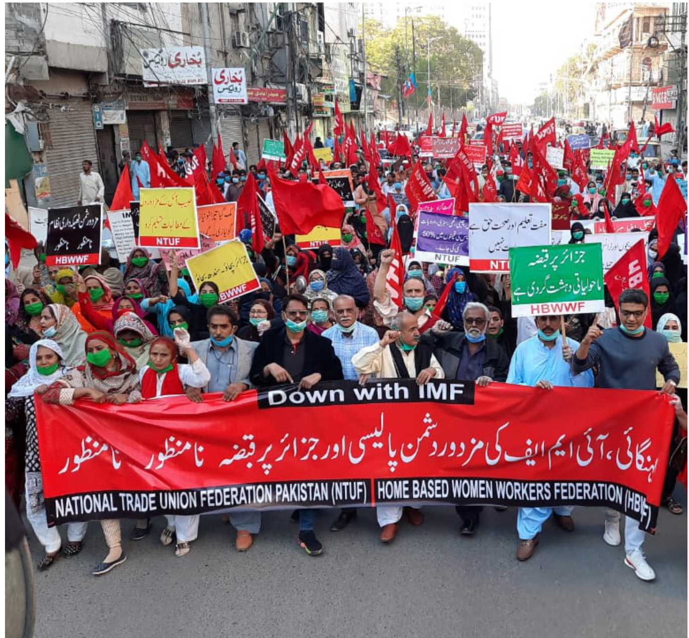
Home-based workers in Pakistan came out of their workplaces and into the streets to attend protests and rallies.

Employers and their role: The Act defines an employer broadly as somebody who directly or indirectly (through a contractor or intermediary) employs a home-based worker “under an agreement of employment”. 6 The legislation also explicitly states that employers are responsible for the payment of wages. While this broad definition provides an opportunity to make different levels of the