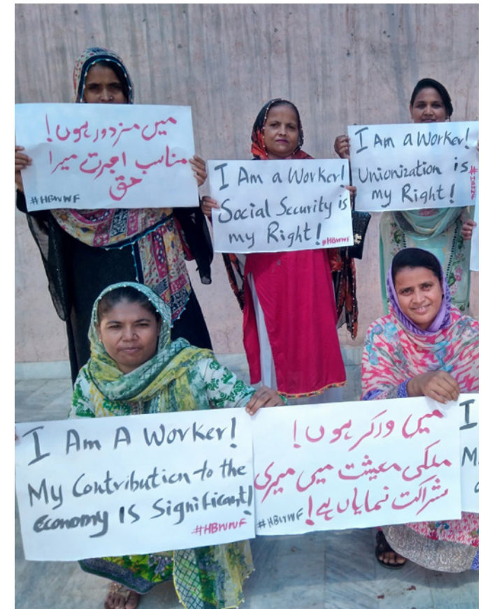
“I Am A Worker! My contribution to the economy is significant!” reads one of the placards held by protesting home-based workers in Pakistan.