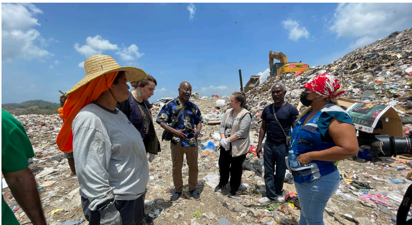
The Special Rapporteur visited the Cerro Patacón dumpsite in Panama with representatives of the Panama National Movement of Waste Pickers and WIEGO.

WIEGO's Law Programme strives to see a world in which: