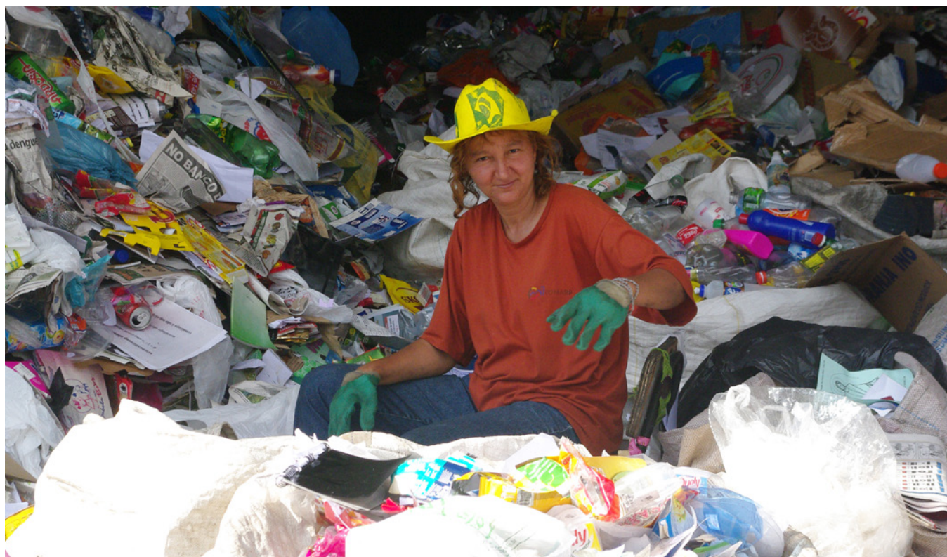
A waste picker in Belo Horizonte, Brazil.

Of the groups, waste pickers have the lowest levels of education. In Brazil nationally, 10 per cent have no schooling and 70 per cent have only primary level schooling. Among women waste pickers in all geographic areas, 80 per cent or more have primary schooling as the highest education level. Among men, the comparable