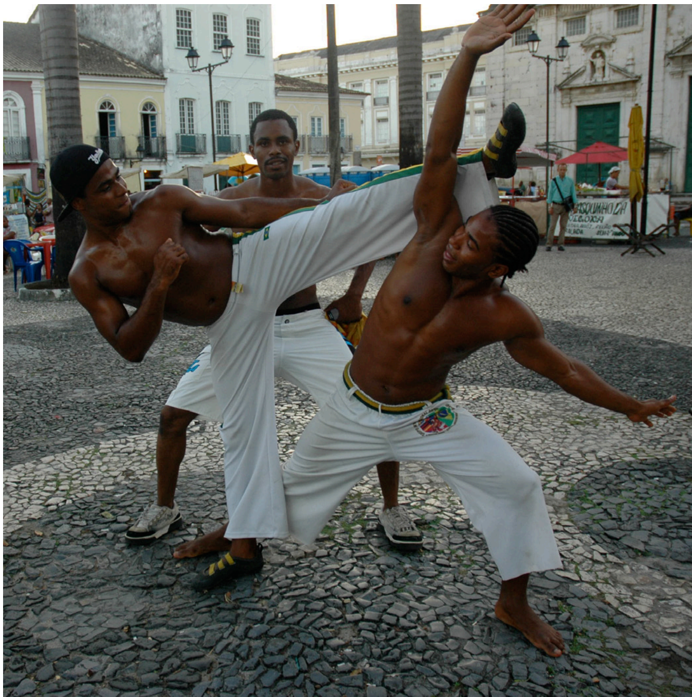
Street performers in Salvador, Brazil.

After home-based workers, street vendors are the group with the highest proportions with tertiary education. Among women 16 to 22 per cent of street vendors have a tertiary education across the geographic areas; among men, 12 to 24 per cent. Additional tabulations show that the majority (78 per cent) of street vendors with a tertiary education are door-to-door salespersons. Although highly educated, more than half are informal.