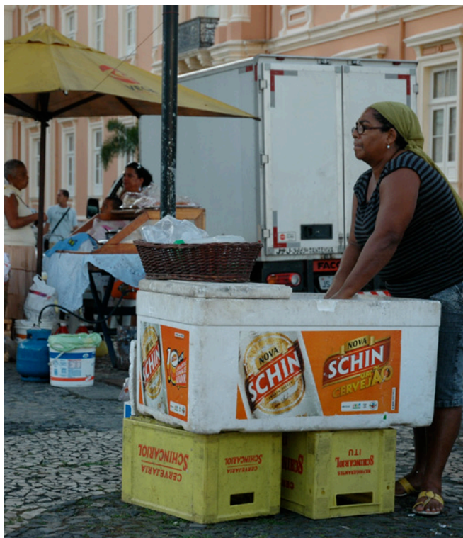
A street vendor in Salvador, Brazil.

area. In numbers this reflects a decrease of around 5.8 million workers nationally.