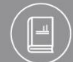
Daryaganj Book Market

Markets like Daryaganj Sunday Book market and Chor Bazaar are one of the oldest markets in Delhi. The Daryaganj Sunday Book market is considered a heritage market as per the Street Vendors (Protection of Livelihood and Regulation of Street Vending) Act of 2014