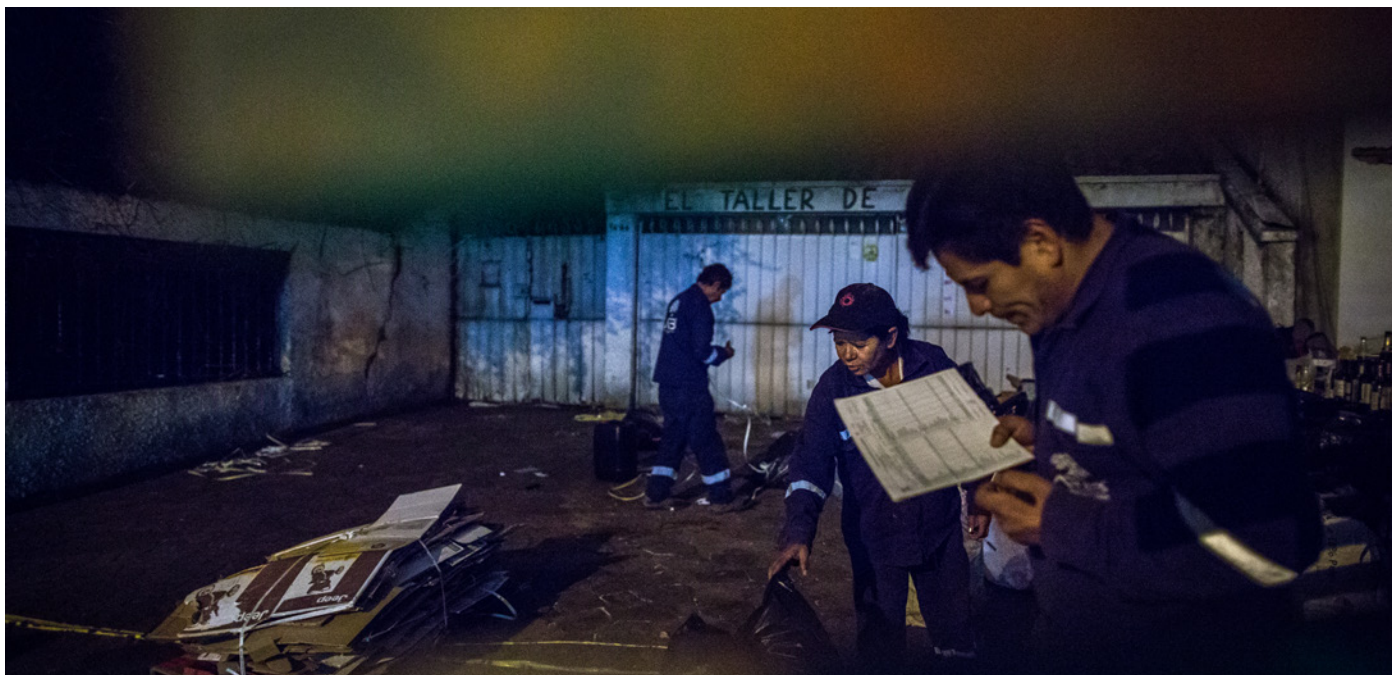
A waste picker in Bogotá loads the materials she has collected into the Waste Pickers' Association of Bogotá's truck.