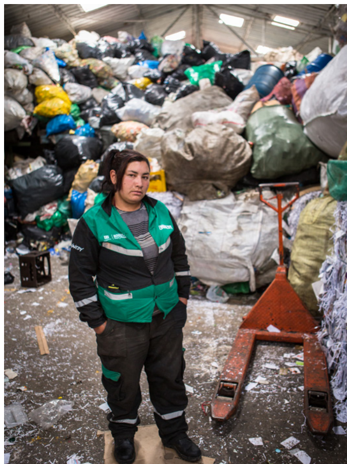
A member of the Waste Pickers' Association of Bogotá at the association's warehouse in the Colombian capital.

A "Guide for preparing the waste picker census under the framework of Resolution 754 of 2014" was developed in 2016 for municipal authorities by the Ministry of Housing, City and Territory following the Constitutional Court Order of 2011. This manual provides methodological guidelines and a list of topics that should be part of a waste picker census. The Ministry, in its capacity as the regulator of public services, made it mandatory for all municipal waste management plans to include a census of waste pickers. Additional regulations affecting waste pickers