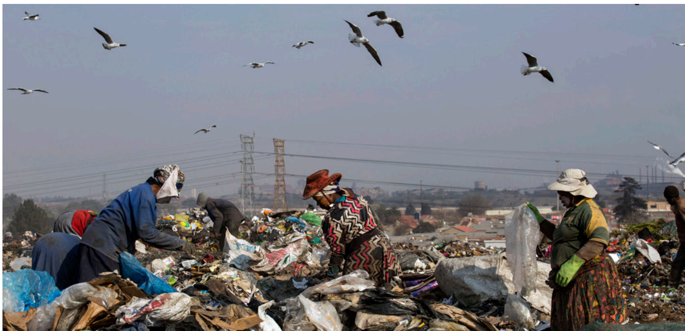
Waste pickers at the Boitshepi landfill near Johannesburg.

was requested on the reasons for migration into the city and the rationale for choosing waste picking over other forms of work.