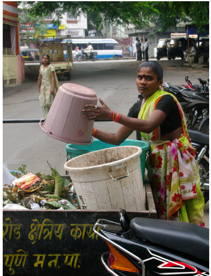
A waste picker in Pune, India.

The Solid Waste Management Rules, 2016 13 provide the institutional framework within which workers in the waste value chain operate. Rule 11 requires the state urban development department to prepare a state policy and solid waste management strategy for the state or the union territory, in consultation with stakeholders, including representatives of waste