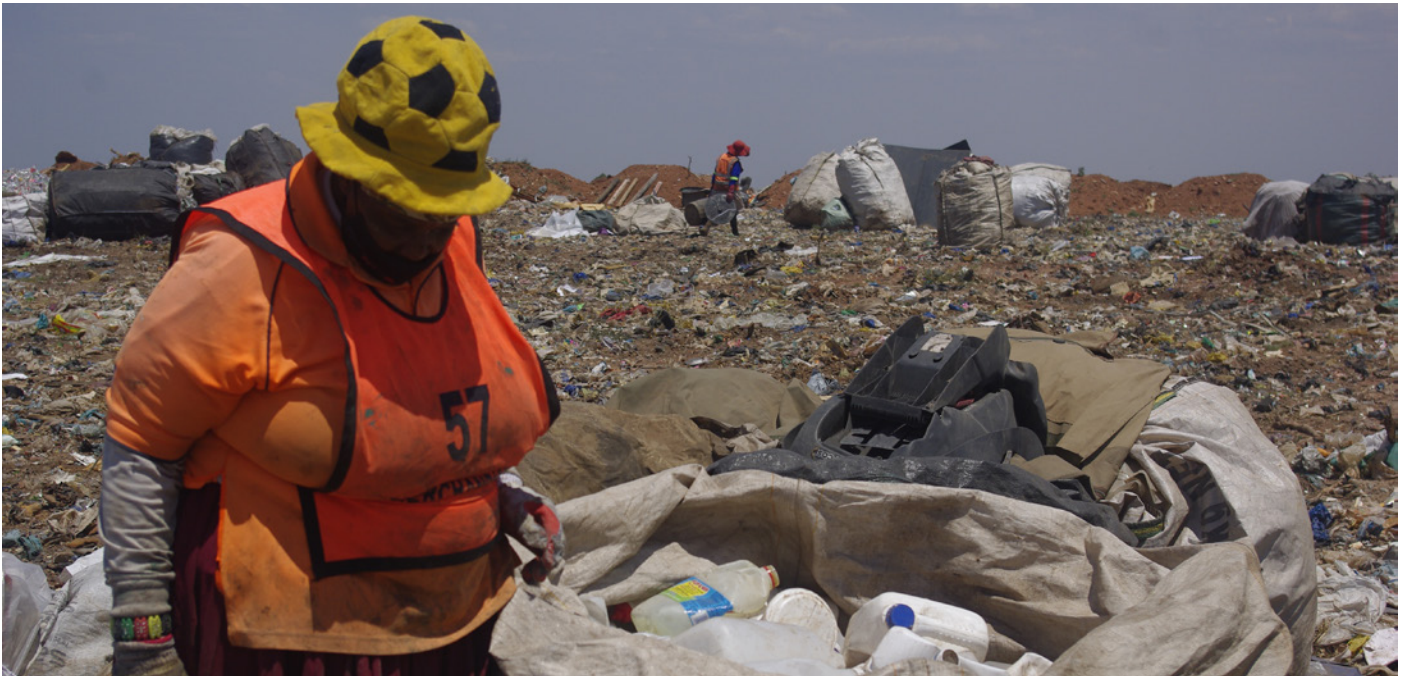
A waste picker on Johannesburg's Marie Louise landfill.