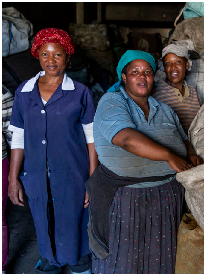
Waste pickers in Johannesburg, South Africa.

Following these commitments, between 2011 and 2016 the Department of Environmental Affairs and the South African Cities Network organized a number of workshops on waste picker integration. The government then convened a Waste Picker Integration National Stakeholder Working Group, which met from 2016 to 2019. The Working Group was composed of representatives from the African