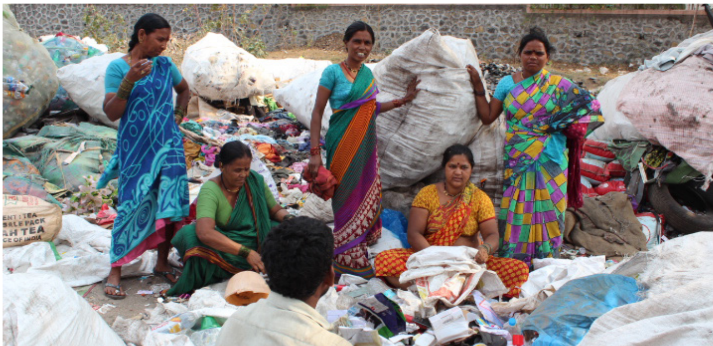
Waste pickers in Pune.

the time of intake, and locations of the municipal skips and sorting centres are recorded using GIS mapping, with handheld devices such as smartphones. Scans of bank passbooks are used to collect bank account details. The school performance reports of the children are collected to record their educational status and performance.