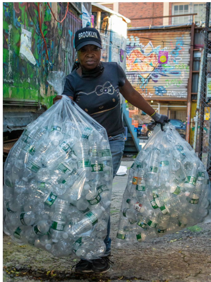
A waste picker in New York City.

The purpose of the survey was to bring visibility to canners in New York City by generating a database on their socioeconomic characteristics and working conditions, which then could be used in discussions with government officials on waste policy – at a time when a proposal for an expanded Bottle Bill (that would double the deposit amount) was being discussed in the legislature. The survey also aimed to reach out to canners and to inform them about canner organizing in NYC.