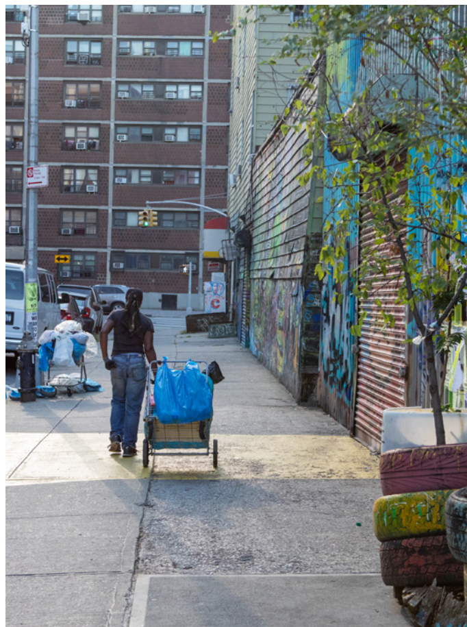
A waste picker in New York City.

This report draws on the experiences of organizations of waste pickers from different parts of the world and their efforts to develop and make data on them available to policymakers and others. Waste picker organizations have been at the forefront in places