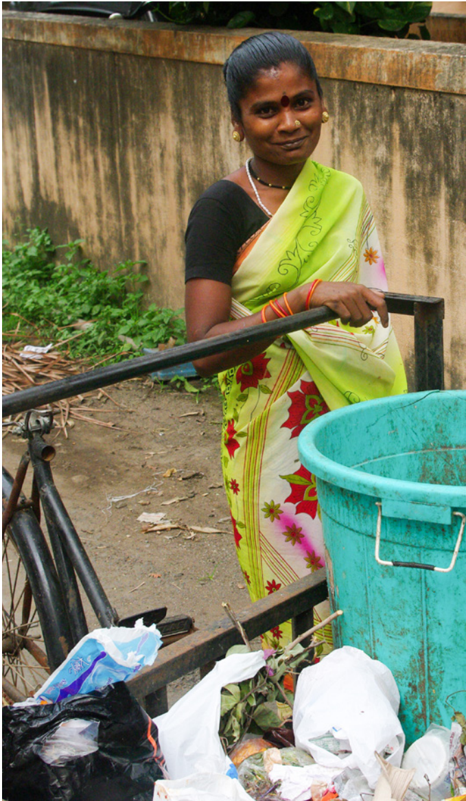
A waste picker in Pune, India.